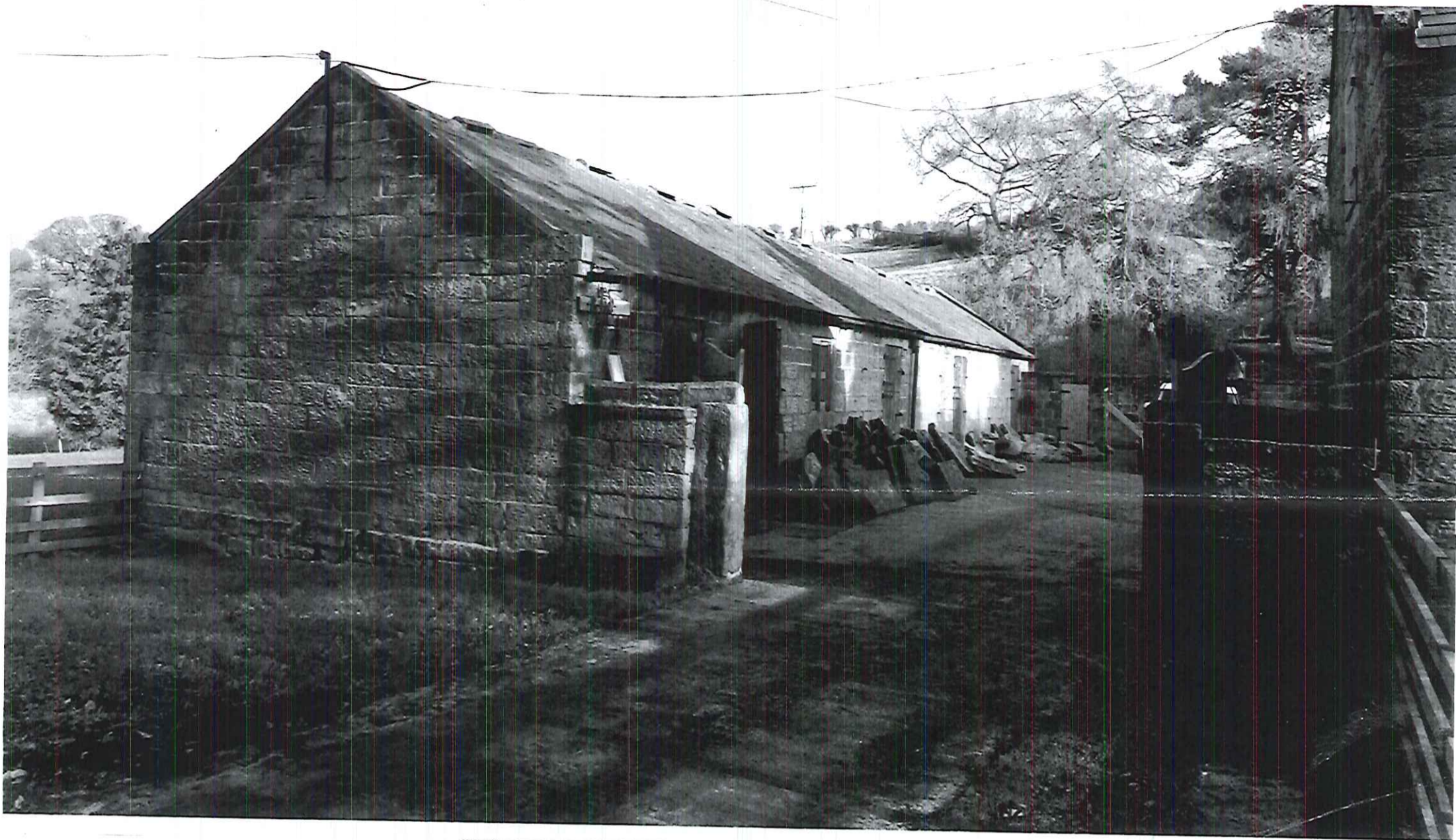
end elevation A and elevation to courtyard.