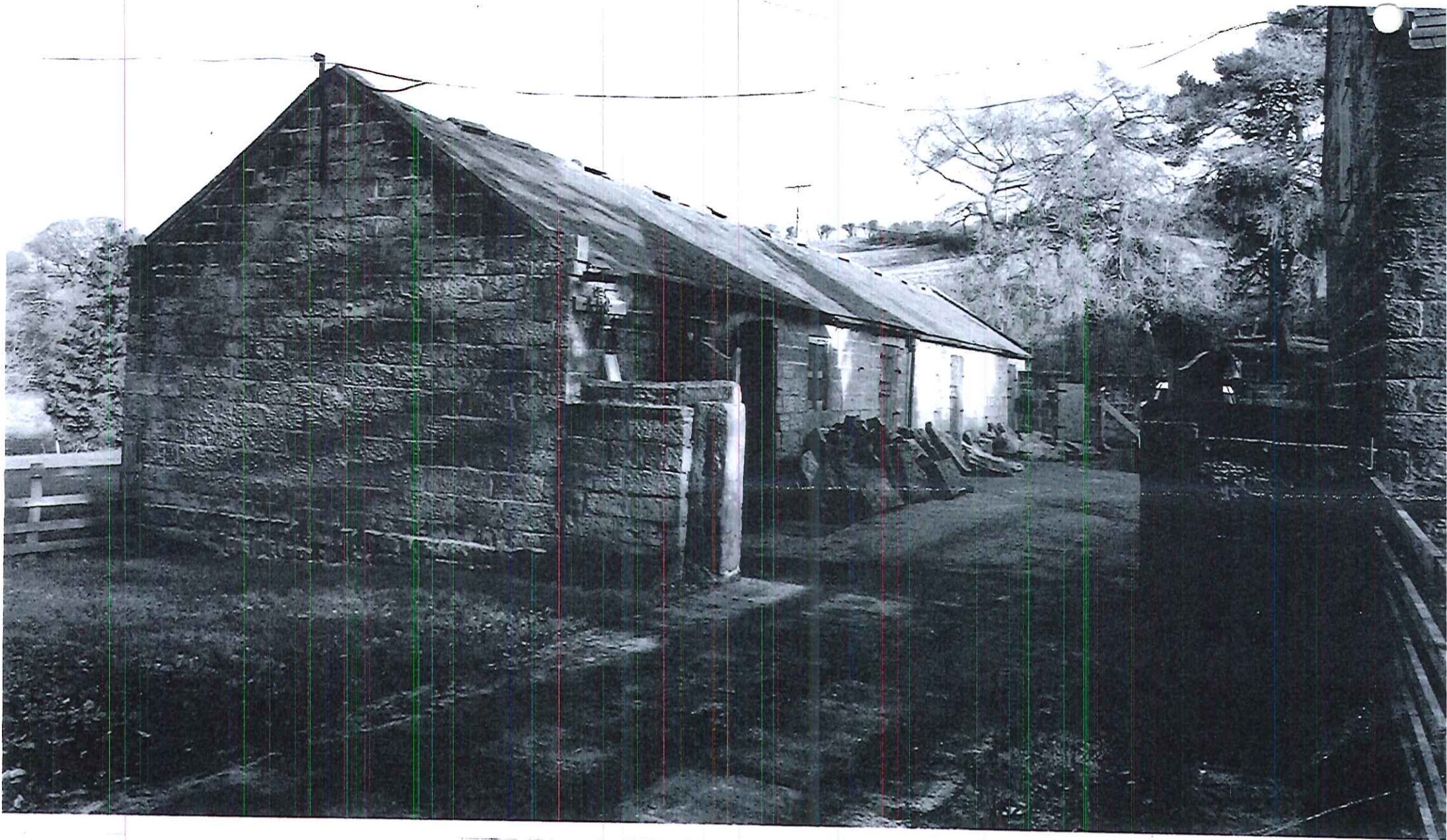
end elevation A and elevation to courtyard.