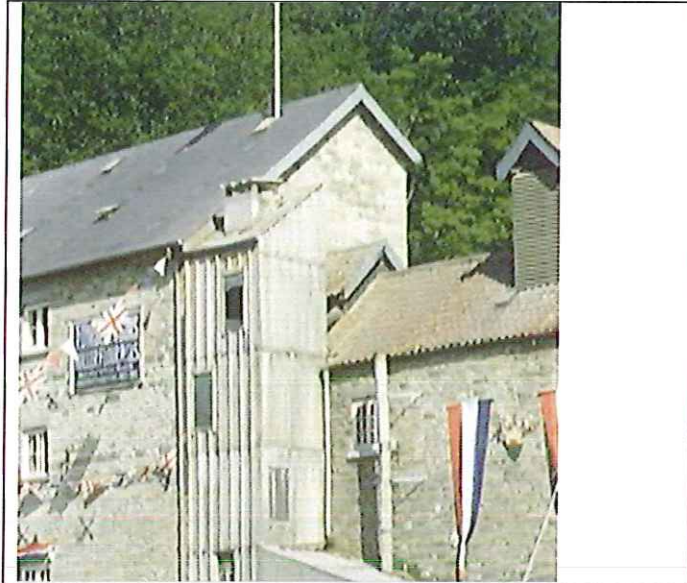
Another photograph showing the Mill at the Coronation celebrations.