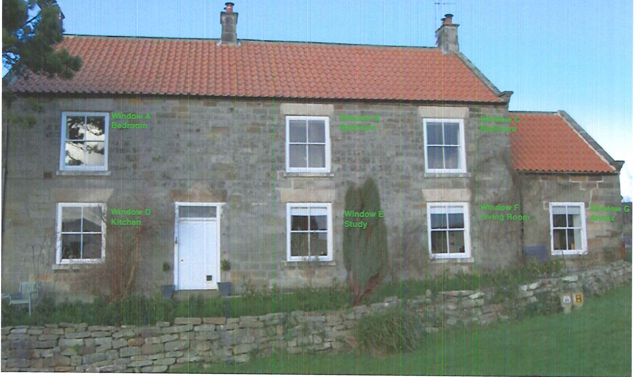
Appendix a - Front elevation of the property