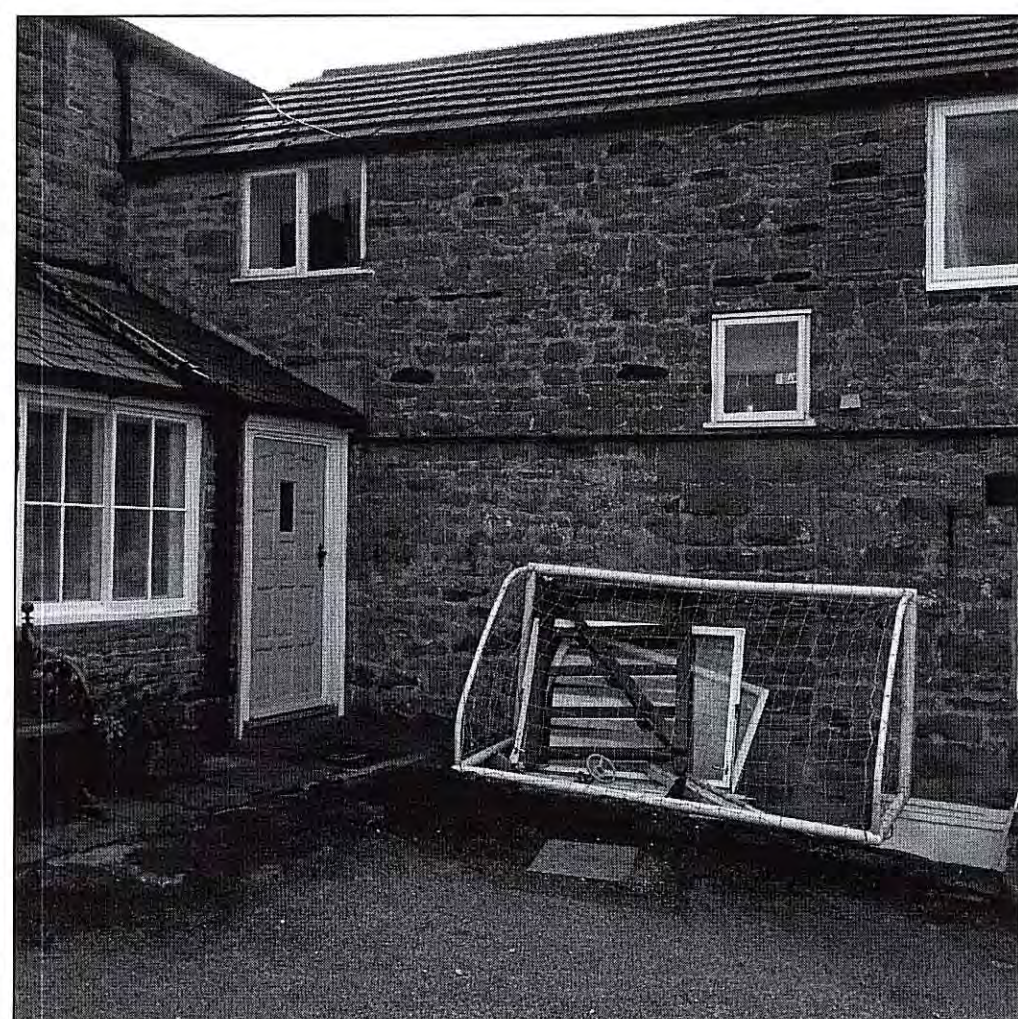
REAR ELEVATION NO ALTERATIONS