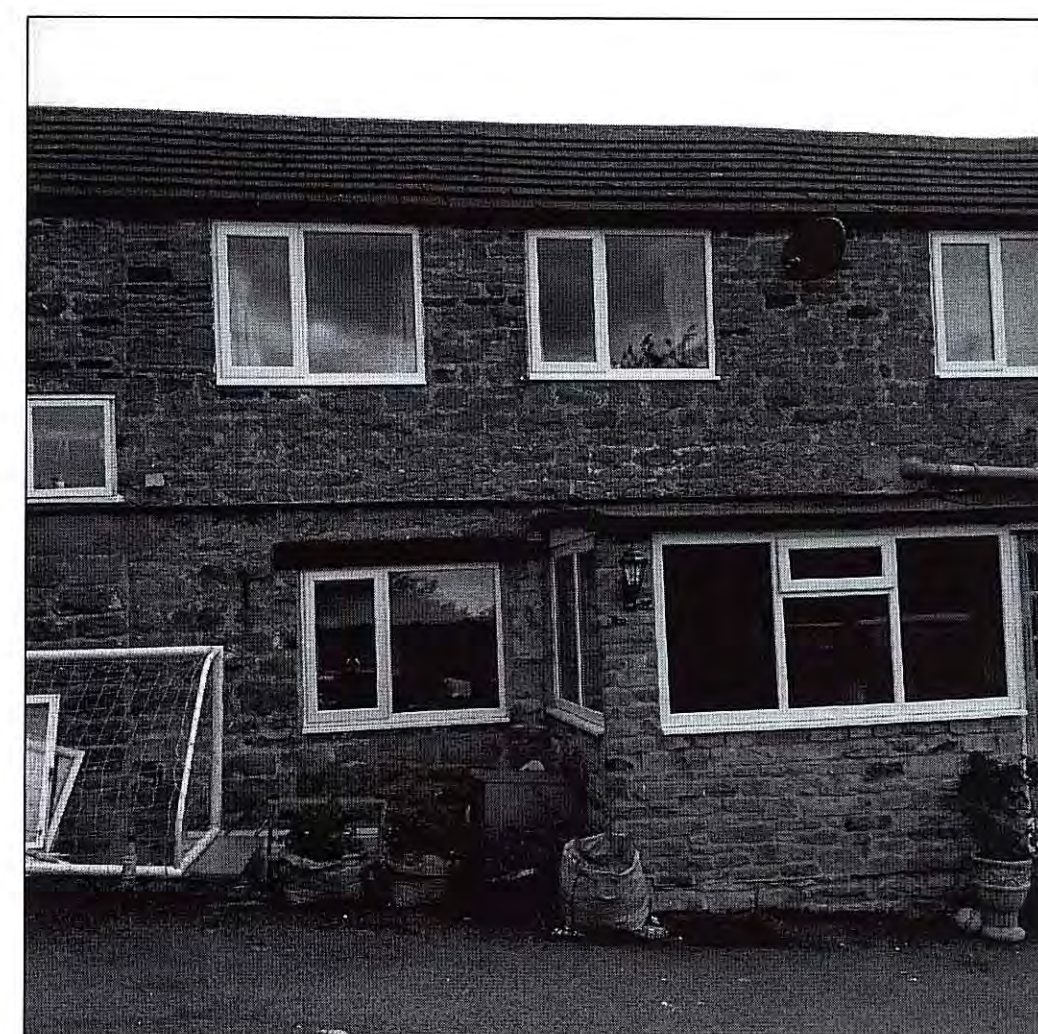
REAR ELEVATION NO ALTERATIONS