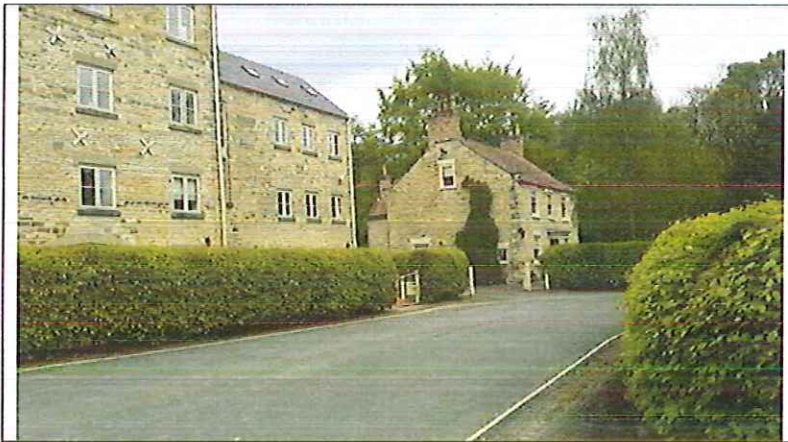
Photograph showing the relationship of the Mill to the Mill House.