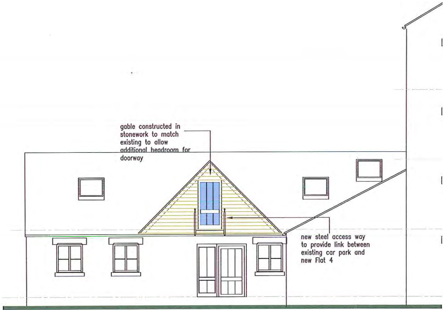
proposed internal elevation (West)