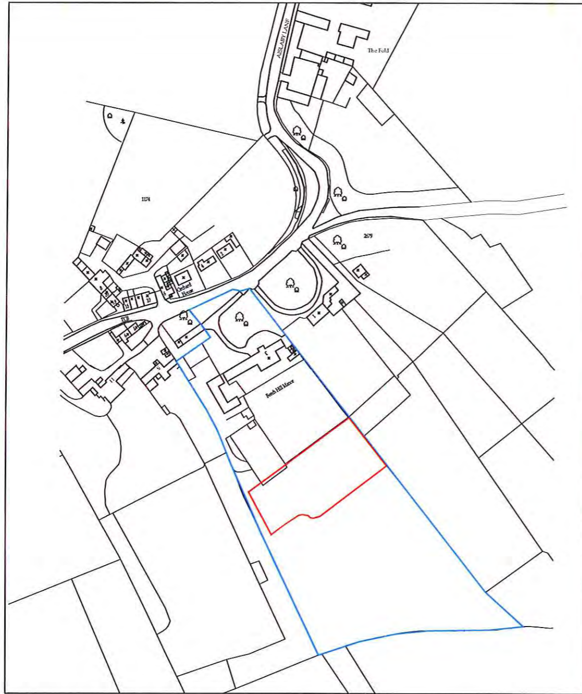
○ Site Plan Scale 1:2500