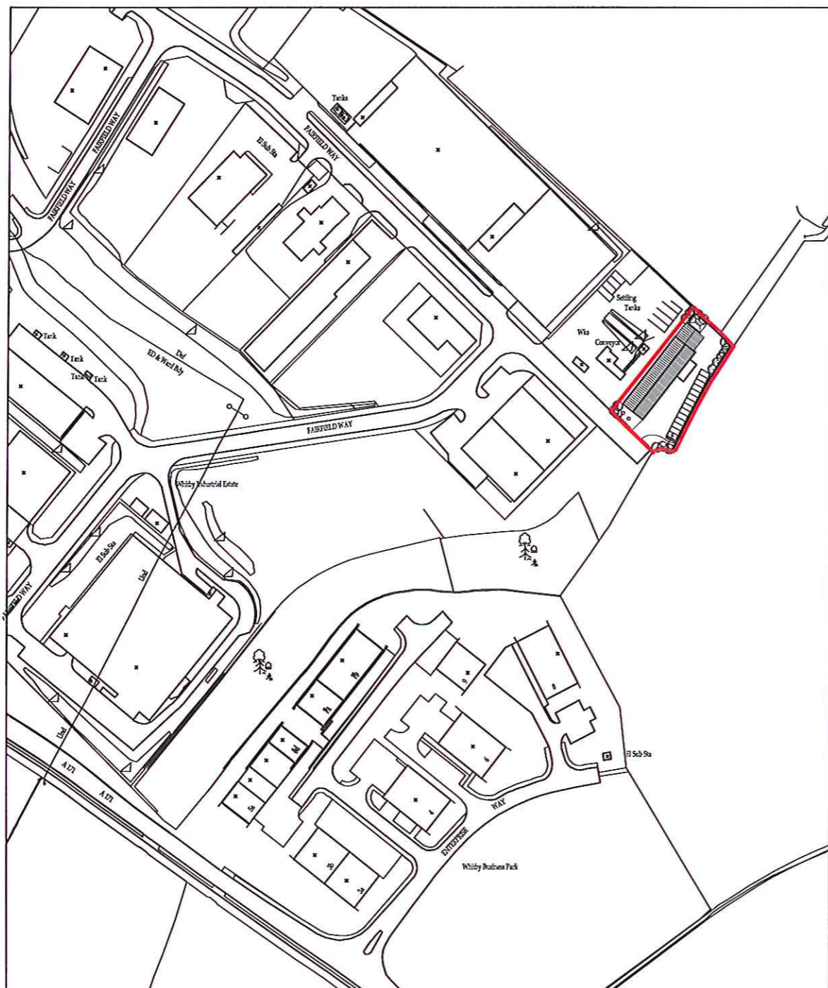
Site Plan Scale 1:2500