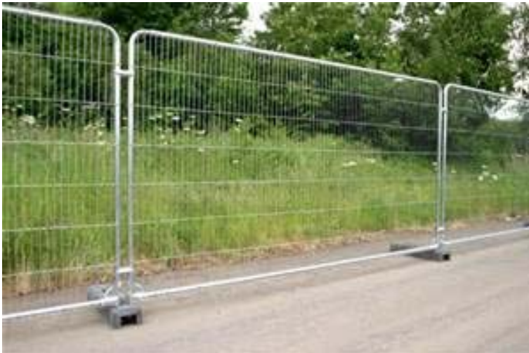
Figure 2: Illustrative Temporary Heras Fencing

As outlined in Section 3.1, where temporary fencing is to be provided, this will consist of 2m high galvanised steel Heras fencing as illustrated in Figure 2.