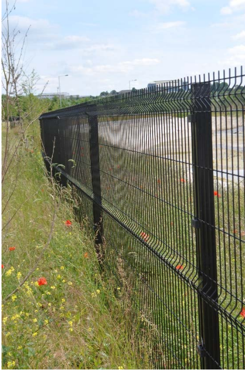
Figure 1: Illustrative Mesh Fence

Where gates are to be provided within the fence line, these will be of a similar specification and detail. Black metal gate posts will be installed in accordance with the manufacturer's details. Locations of these are detailed on drawing YP-P10-DNF-CX-004, Dove's Nest Farm Phase 2 Masterplan and will form double leaf hinged gates.