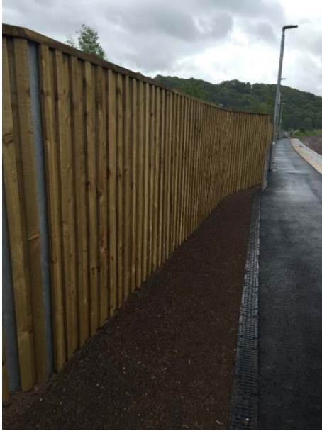
Figure 3: Illustrative Acoustic Fence / Environmental Barrier

Acoustic fencing will be provided along the western side of the platform adjacent to the existing wooded area. This will be provided for an approximate length of 300 metres, as detailed on drawing YP-P10-DNF-CX-004 Dove's Nest Farm Phase 2 Masterplan. This will consist of a 3m high, wooden, close boarded fence fixed on wooden posts to the chosen manufacturer's requirements. The fence will not be painted. An example of an acoustic fence can be seen in Figure 3 below.