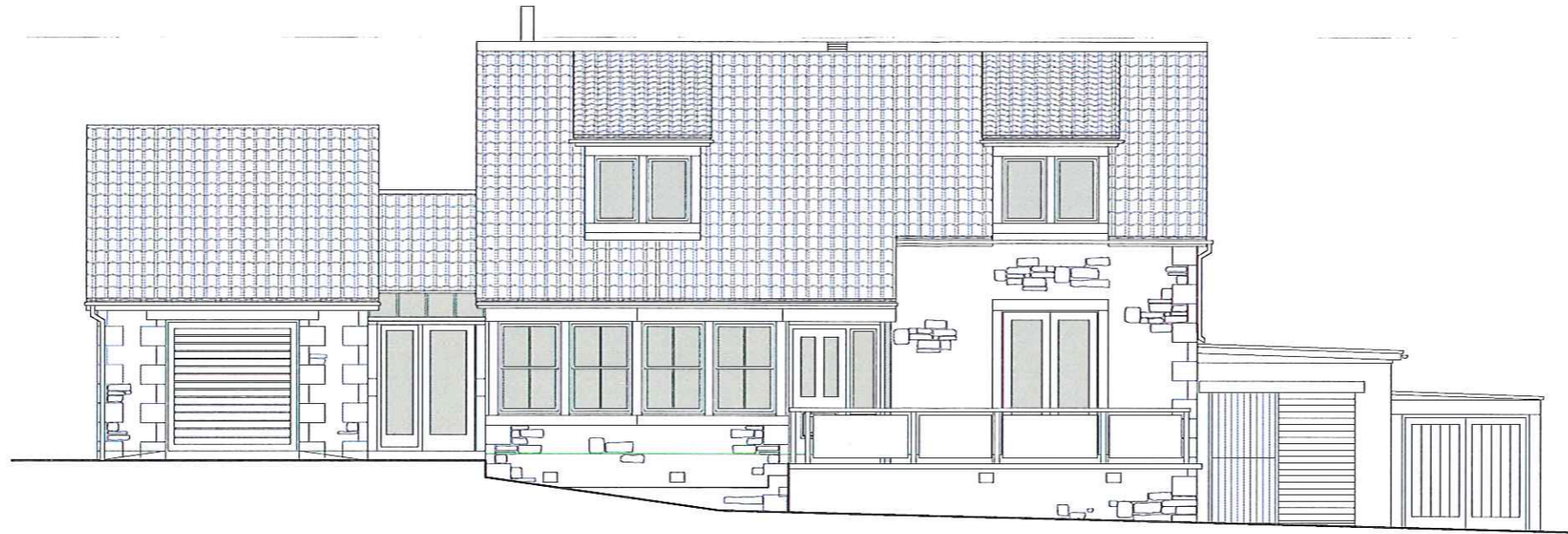
N O R T H E A S T E L E V A T I O N

AMENDMENT: Omit timber decking. Add natural coursed stone supporting walls with natural stone flag paving. Guard rail to be powder coated circular hollow section steel. Top rail to be oval section steel also powder coated finish. Colour ref RAL 1015. Clear safety glass panels between supports. Design and installation by specialist proprietary manufacturer.