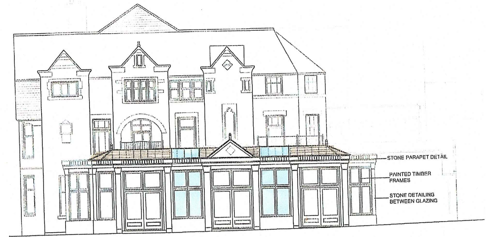
SIDE (SOUTH) ELEVATION