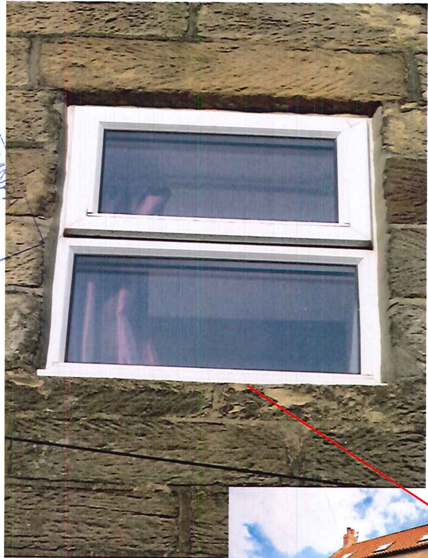
Second floor window neighbouring side access road