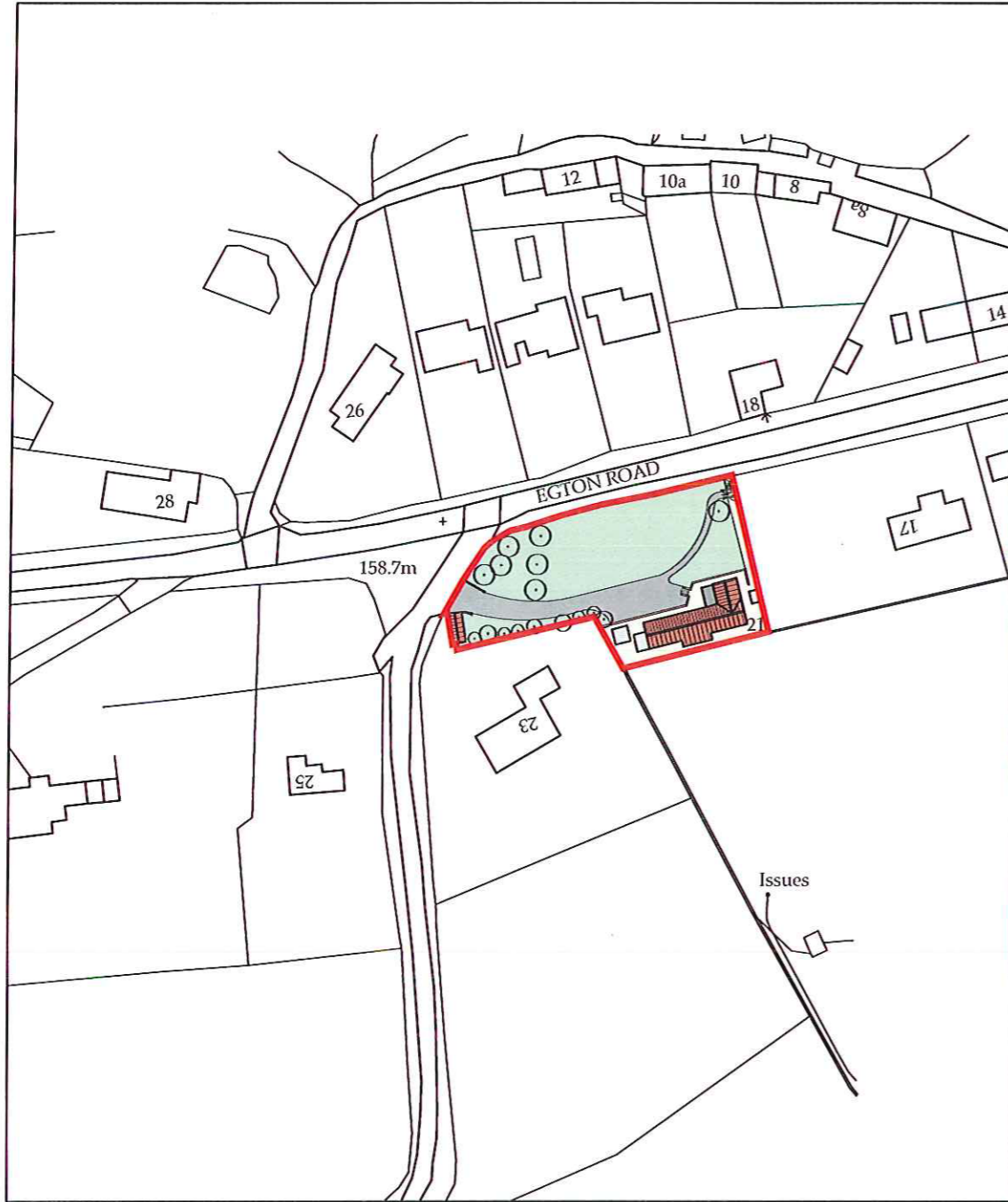
○ Site Plan Scale 1:1250