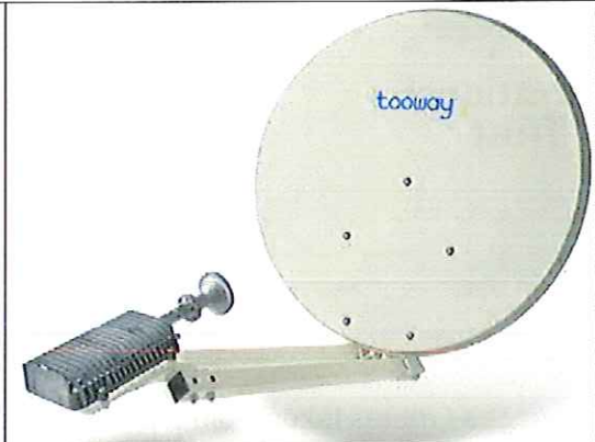
Representation of the type of dish (between approx 760 and 1000 mm diameter)