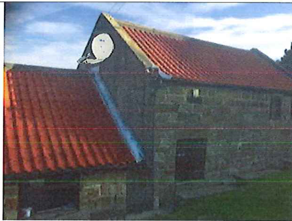
Proposed satellite position at Peakeside