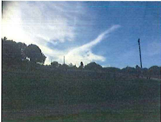
Line of sight required to southern sky (9 degrees east of south and 30 degrees from horizontal)