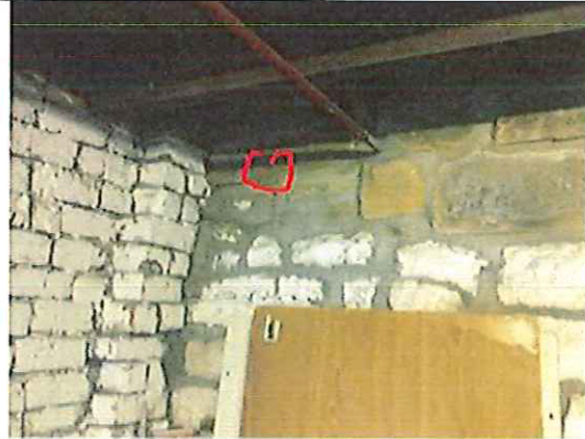
Entry point to store room