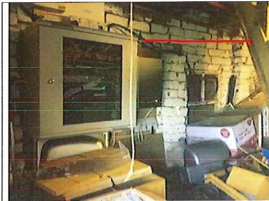
Cable route within store room