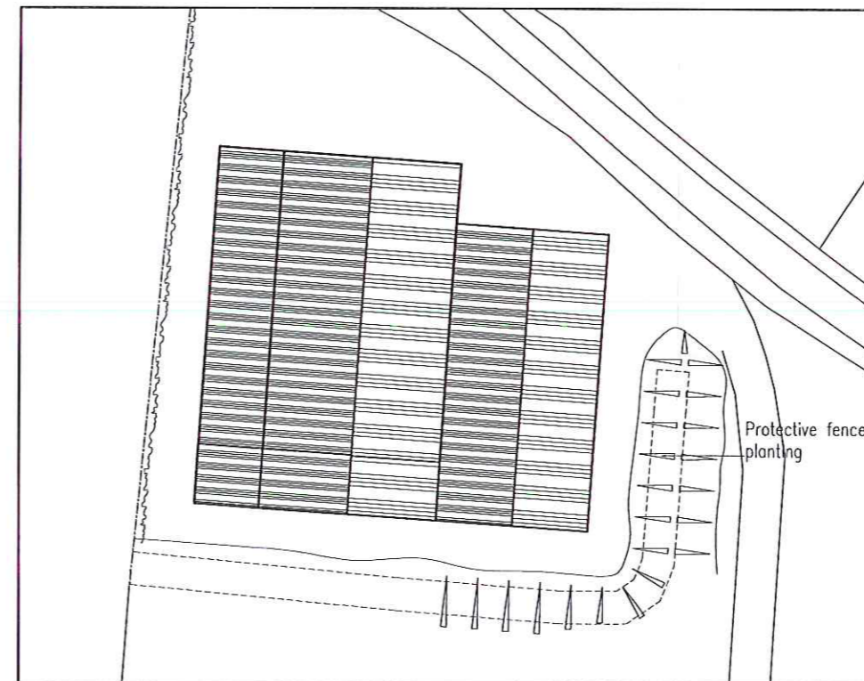
3 PROPOSED BLOCK PLAN SCALE:1:500