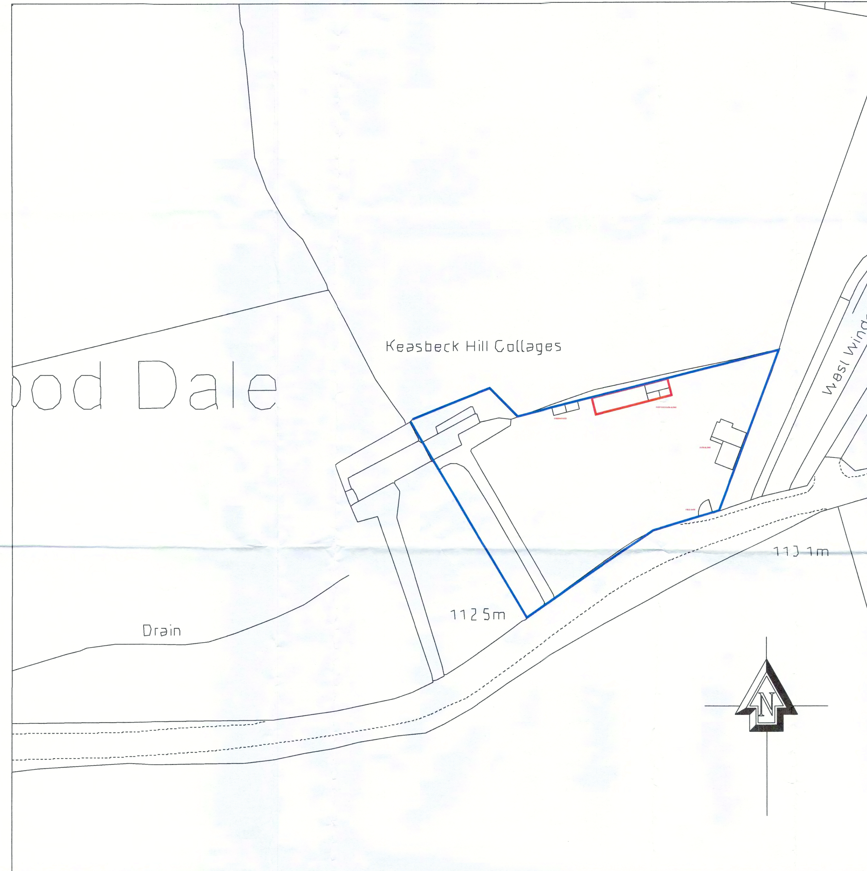
BLOCK PLAN SCALE 1:500 @ A1