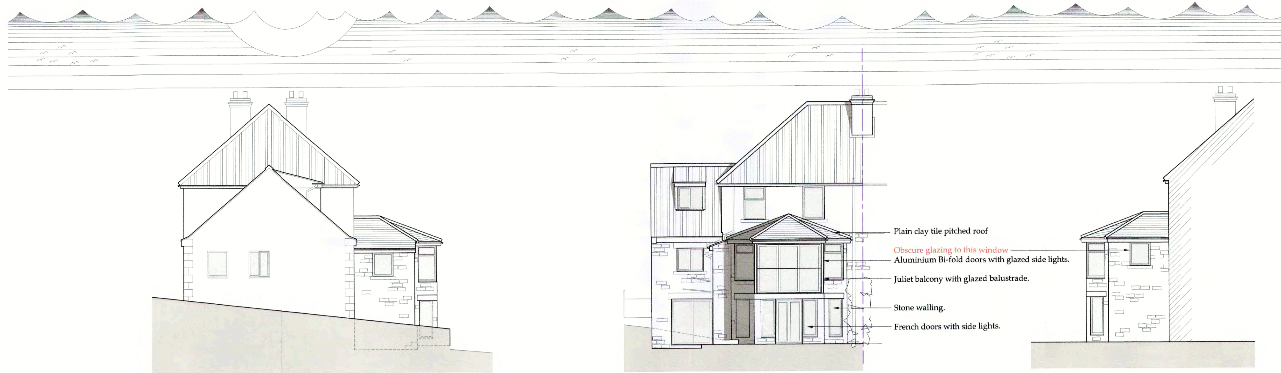
Side Elevation - South West Scale 1:100