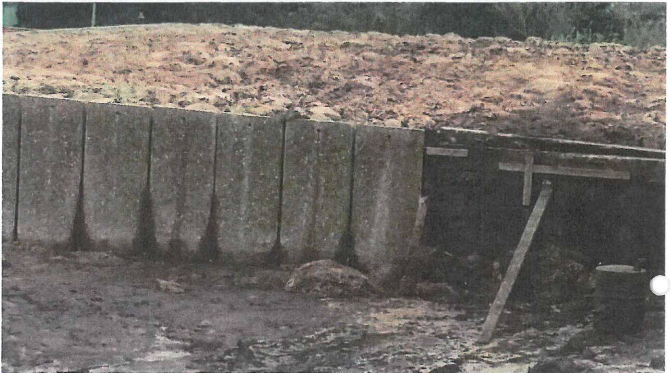
Fig 4. The weeping wall store

The liquid portion collects in three settlement tanks and is spread via a sprinkler system which runs automatically when the final tank is at capacity.