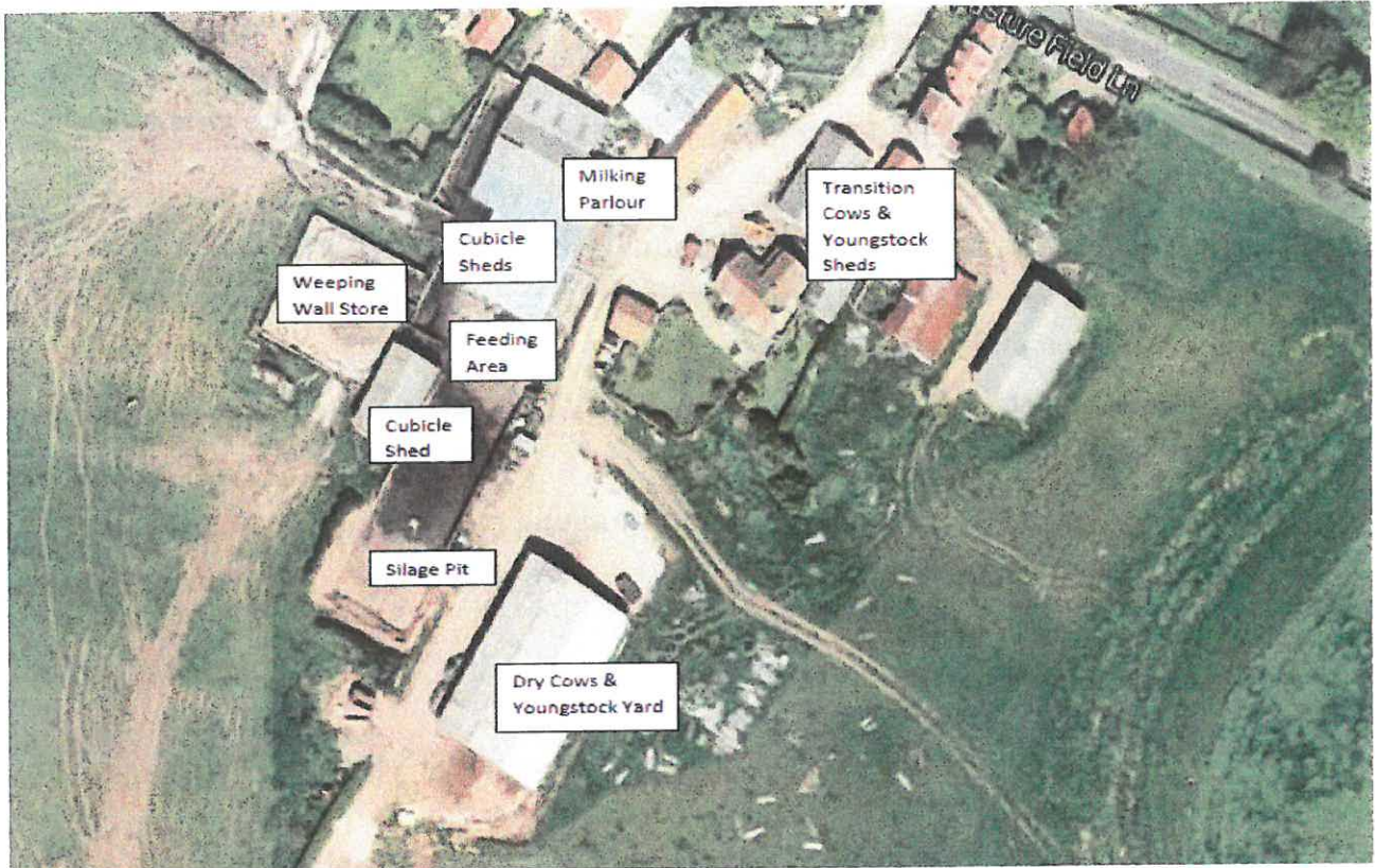
Fig. 1 The layout of High Farm