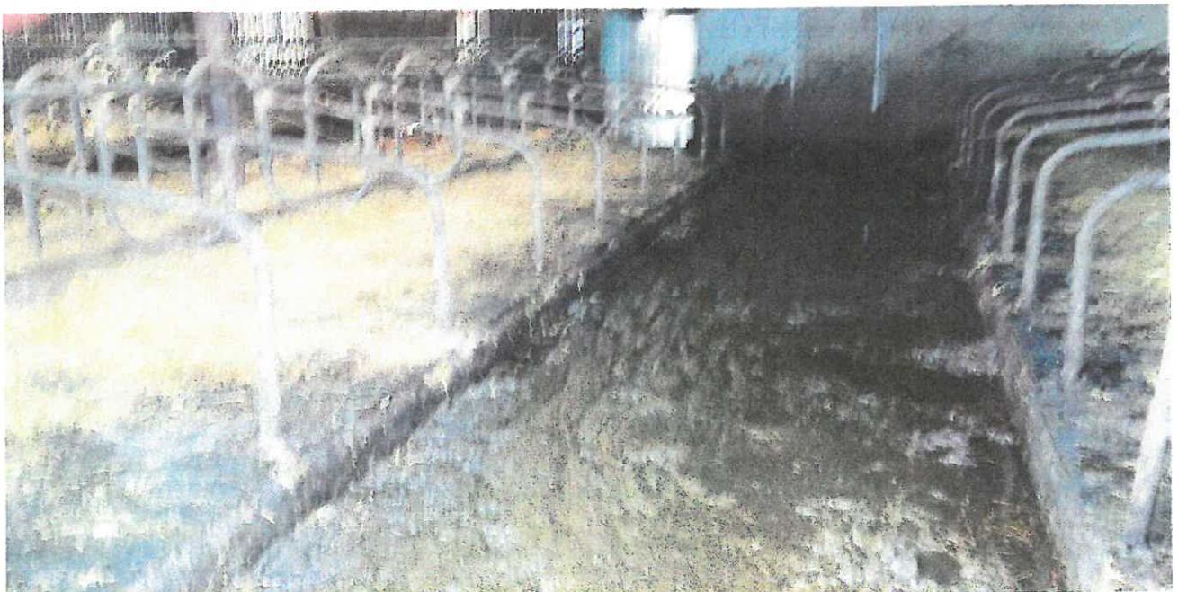
Fig 2. One of the cubicle sheds adjacent to the parlour.

The 120 milking cows are housed on cubicles across three buildings with sawdust being used as bedding. The cubicles are scraped out twice a day along with the collecting yard, cow access areas and the outdoor feeding area.