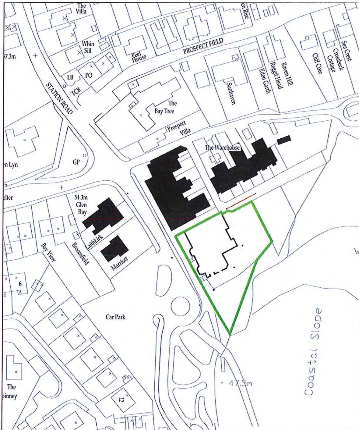
Site Plan Scale 1:1250