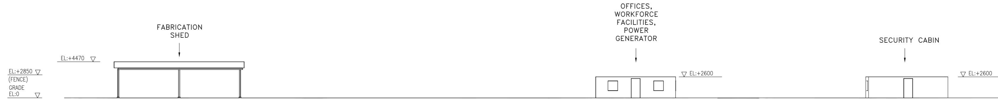
ELEVATION LOOKING SOUTH