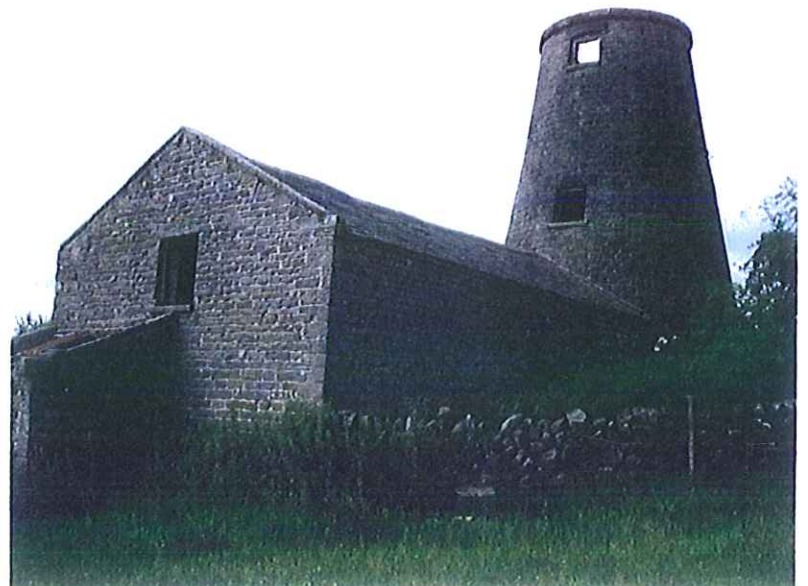
VIEW FROM NORTH EAST