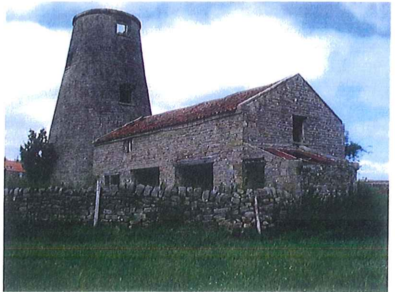
BEACON WINDMILL & BARN / VIEW FROM SOUTH EAST