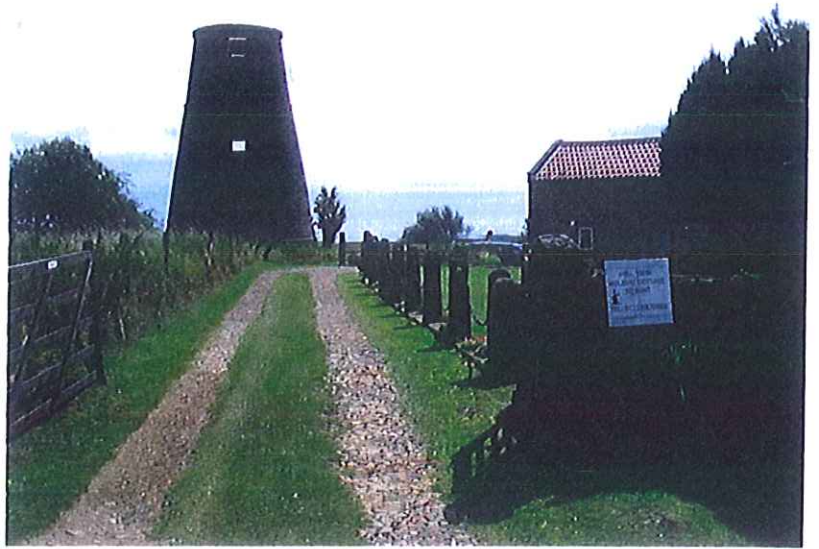
PRIVATE ACCESS ROAD FROM MAIN ROAD/ WEST VIEW