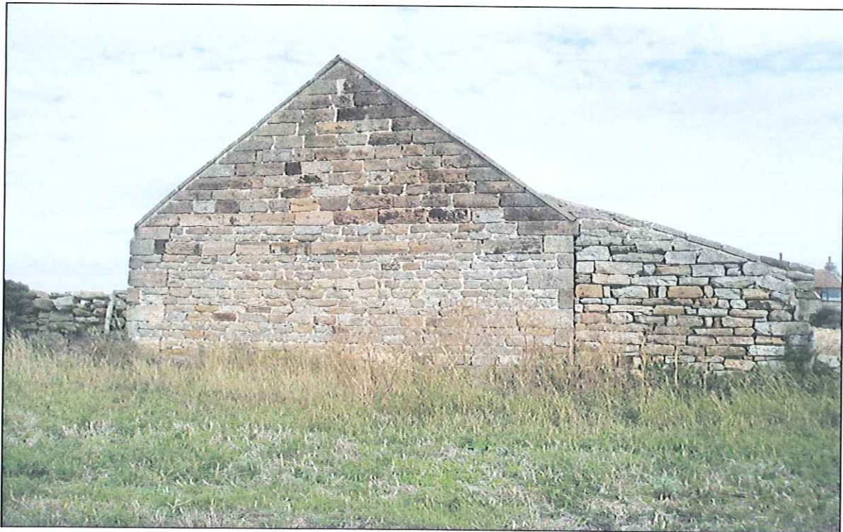
PHOTOGRAPH 4 HIGH BARNS, WHITBY LAITHES, HAWSKER, WHITBY