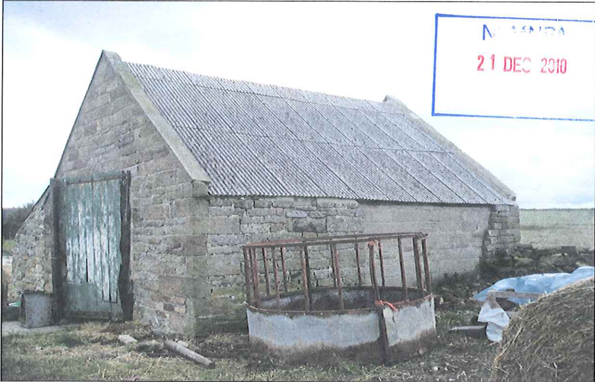
PHOTOGRAPH 1 HIGH BARN, WHITBY LAITHES, HAWSKER, WHITBY