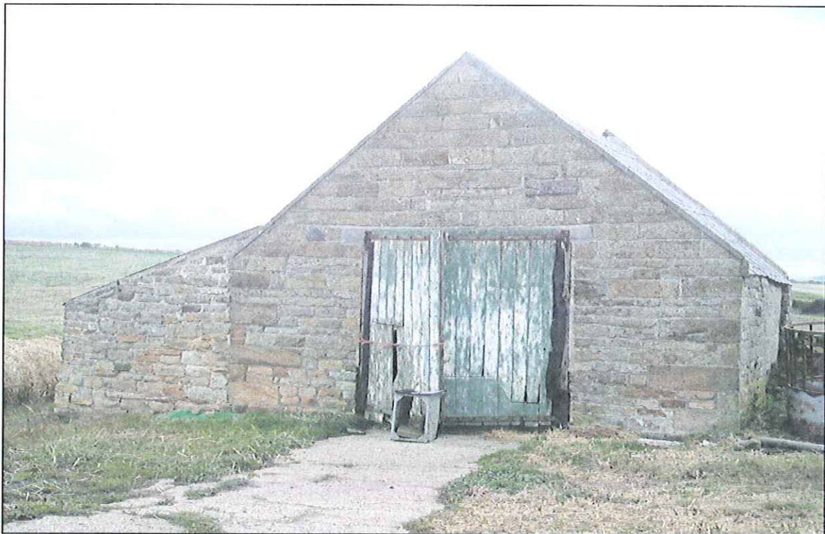
PHOTOGRAPH 2 HIGH BARN, WHITBY LAITHES, HAWSKER, WHITBY