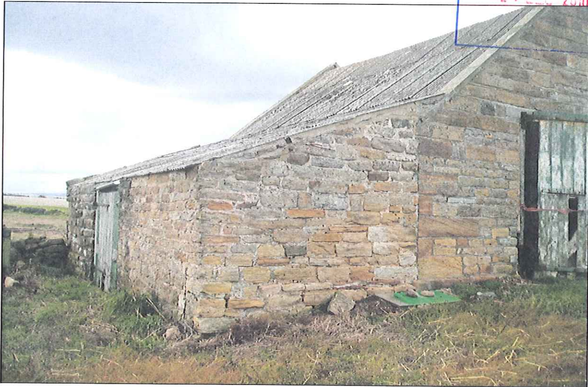
PHOTOGRAPH 3 HIGH BARNS, WHITBY LAITHES, HAWSKER, WHITBY