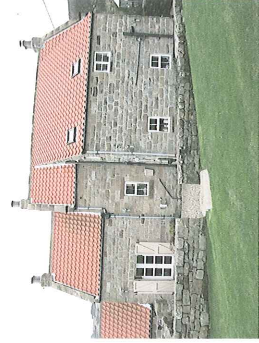
HOUSE AND PEAR TREE COTTAGE, NORTH WEST ELEVATION BARN AND RETAINED WALLS