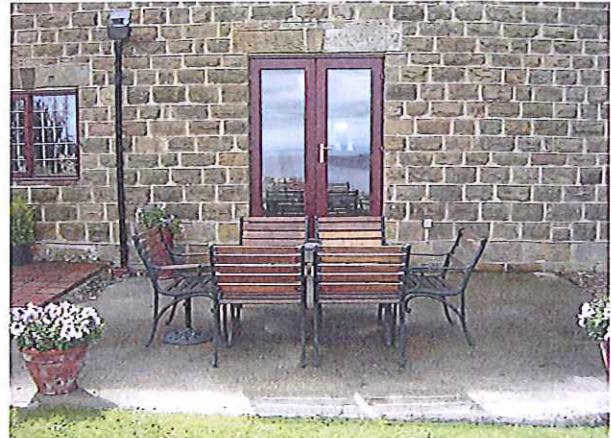
Existing Terrace Showing Concrete Base, Where Proposed Garden Room Would Be Sited - Elevation North