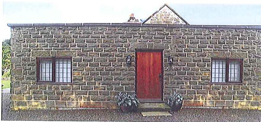
Existing Main Entry And Sitting Room, With Bathroom Proposal, (3,750mm x 3,900mm), Added to Right Hand Side, Using Photoshop Imaging