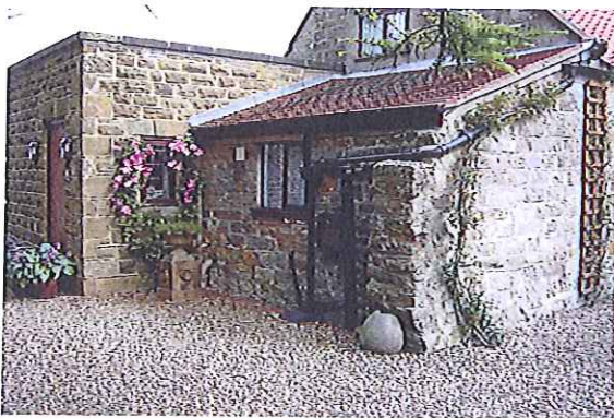
Existing Main Entry and Lean-To Bathroom Without Foundations, (and showing buttress support), Elevation South West