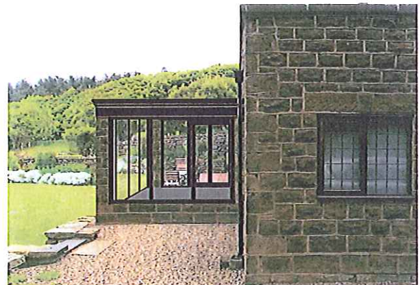
Proposed Garden Room, (4,620mm x 3,900mm), Using Photoshop Imaging Elevation West