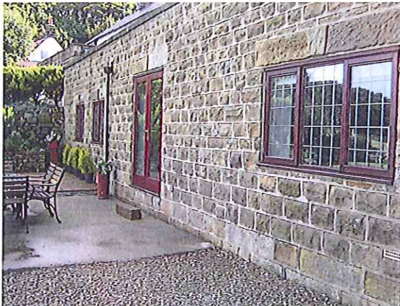
Existing Terrace Showing Concrete Base, Where Proposed Garden Room Would Be Sited - Elevation North West