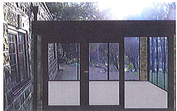
Proposed Garden Room, (4,620mm x 3,900mm), Using Photoshop Imaging - Elevation East