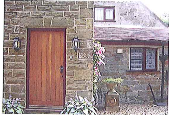
Existing Main Entry and Bathroom, (detail), Elevation West