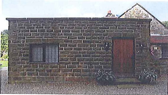
Existing Sitting Room, Main Entry and Bathroom - Elevation West