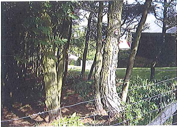
Driveway Entry, Showing Limited View of Property - Elevation South