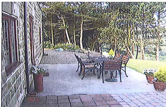
Existing Terrace Showing Concrete Base Where Proposed Garden Room Would Be Sited - Elevation East