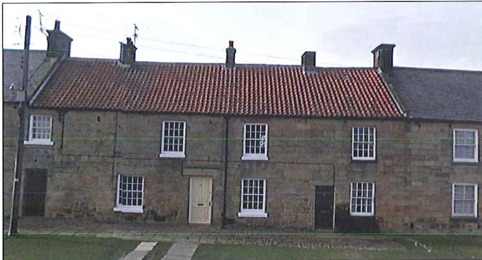
Photograph 02:- West (Rear) Elevation