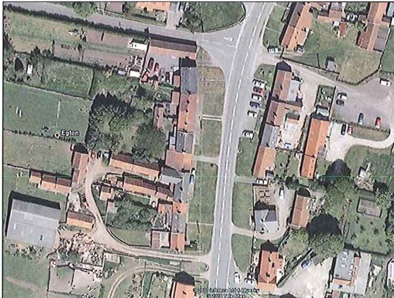
Figure 1.0 Aerial View of Egton

Egton is a small village and civil parish in the Scarborough district of North Yorkshire, England about 5 miles (8.0 km) west of Whitby. Nearby is the village of Egton Bridge which is home to Egton Railway Station.