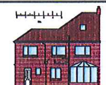
Proposed East (Rear) Elevation