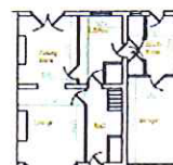
Existing Ground floor Plan