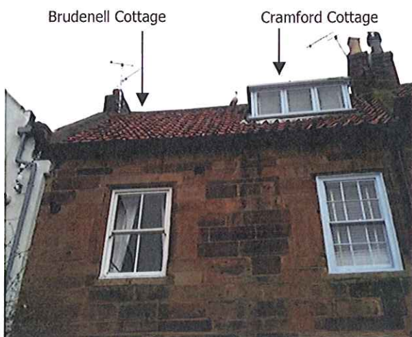
Photograph of the roof as existing