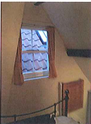
Existing window in the room

Brudenell Cottage is a holiday cottage located along Chapel Street in the heart of Robin Hoods Bay. The property is a two bedroomed newly refurbished former fisherman's cottage. The second bedroom is situated on the second floor within the roof space. This room lacks both natural light and has restricted headroom. The main source of natural light is one window on the side elevation facing the roof of the adjacent building.