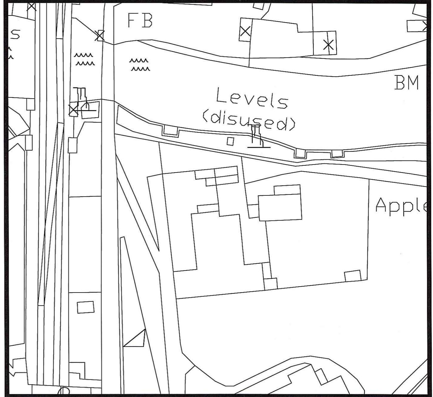
Proposed Block Plan