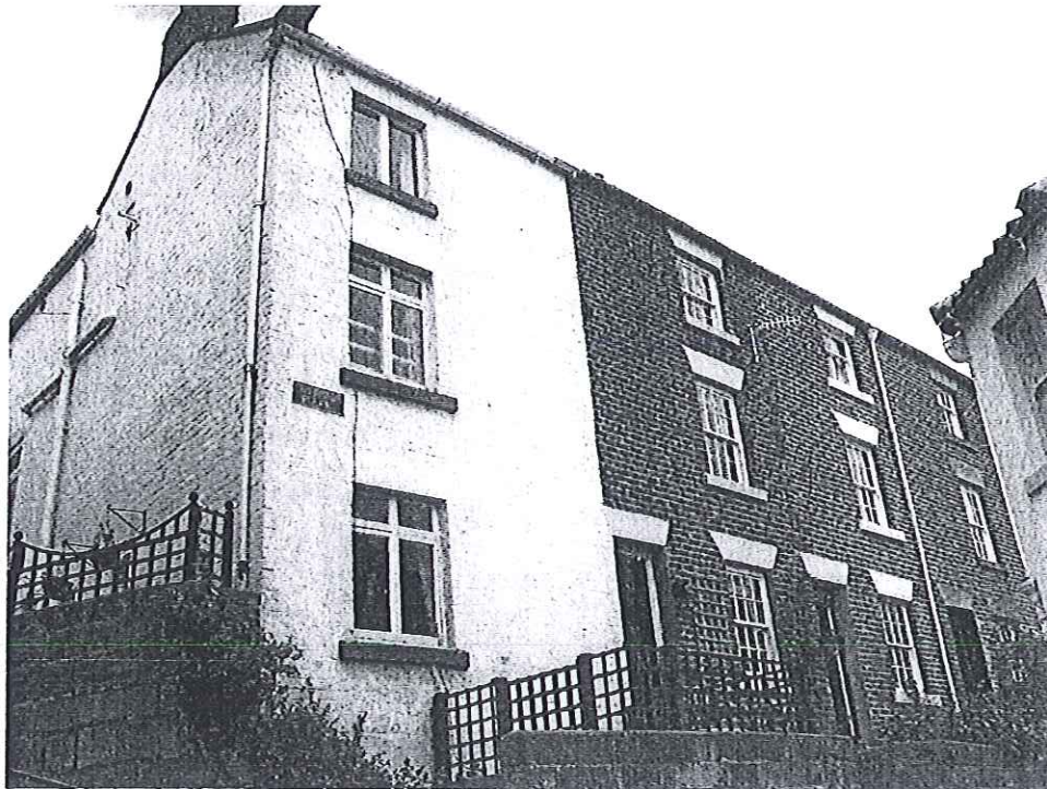
South West corner