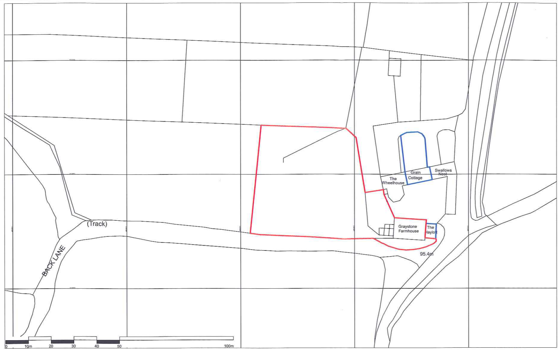
Site Location Plan Scale 1:1000 @ A3