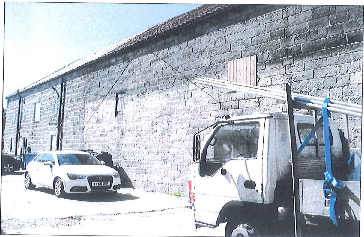
PHOTOGRAPH 4 BANNIAL FLATTS FARM, WHITBY