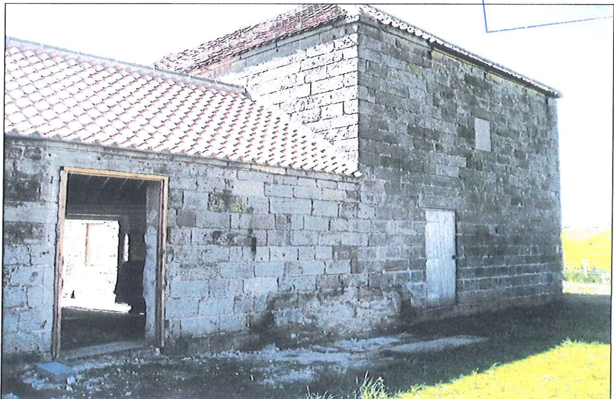
PHOTOGRAPH 2 BANNIAL FLATTS FARM, WHITBY