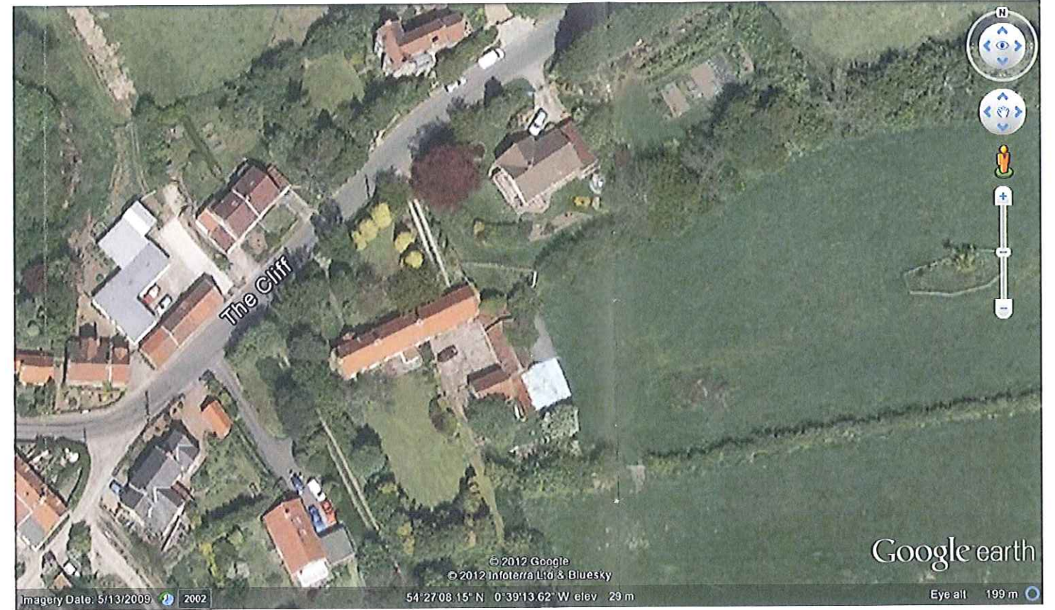
aerial view - google earth

John Blaymires Architect 56 Pasture Lane Seamer Scarborough YO12 4QR tel 01723 863625 CLIENT Mr & Mrs Milnes scale 1: 1250 PROJECT proposed improvements at Cliff Farm DETAIL site drawing no. 2011/21/20P