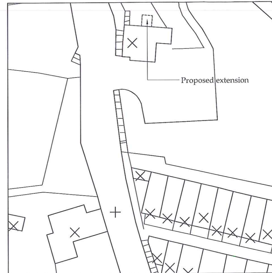
○ Site Block Plan SCALE: 1:500