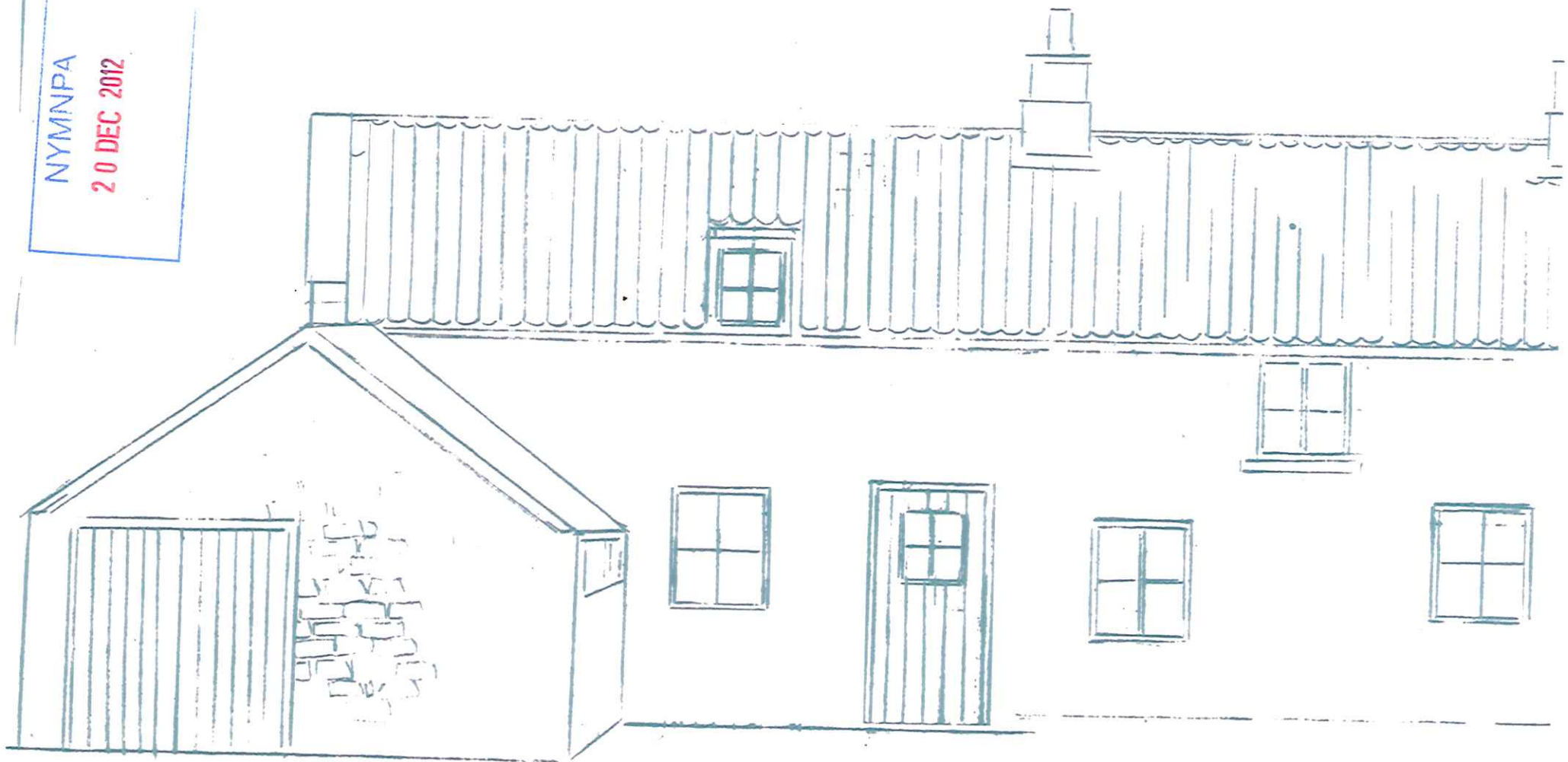
ORIGINAL FRONT ELEVATION