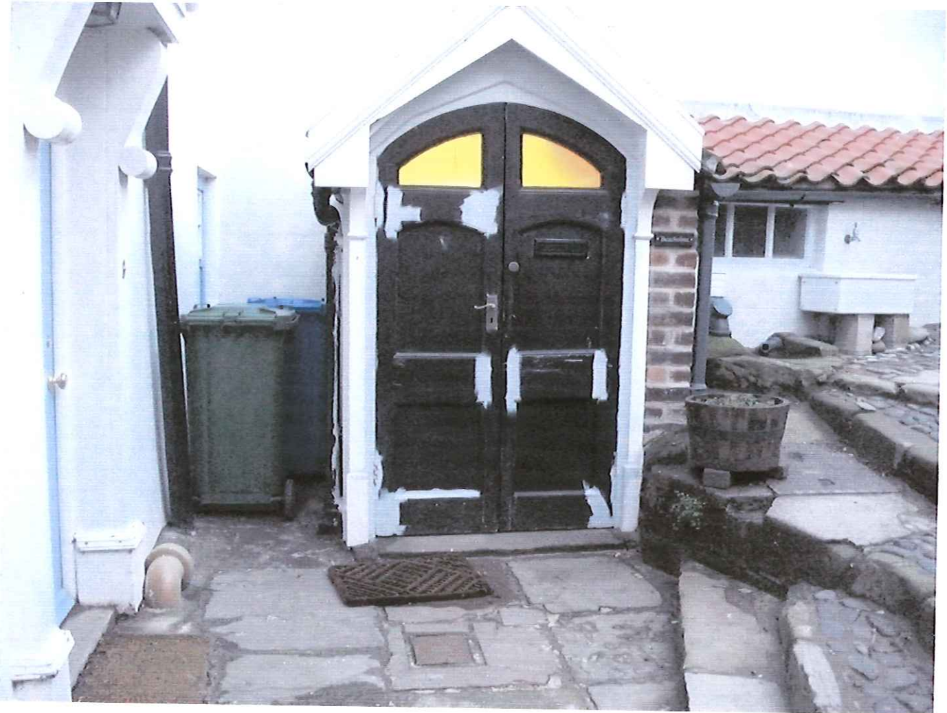
Existing layout of bins store to left of the front door.

Proposed gates would be T&G 25mm softwood painted to match wall. Opening inwards so the posts can be hidden behind the two cast iron pipes.