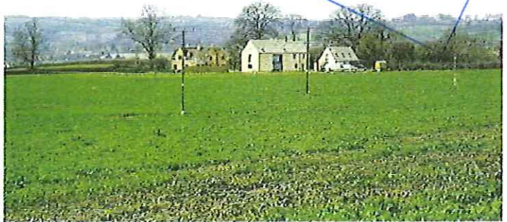
Rural homes: loss of planning policy guidance on occupancy controls regretted

The self-assessment tool will be available on the PAS website, www.pas.gov.uk