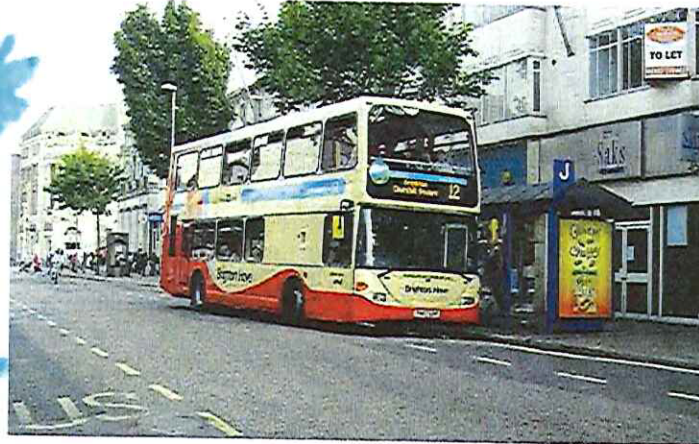
Local bus: integrated public transport is more common in other developed nations

This means starting from the proposition that the full, objectively assessed needs for things such as