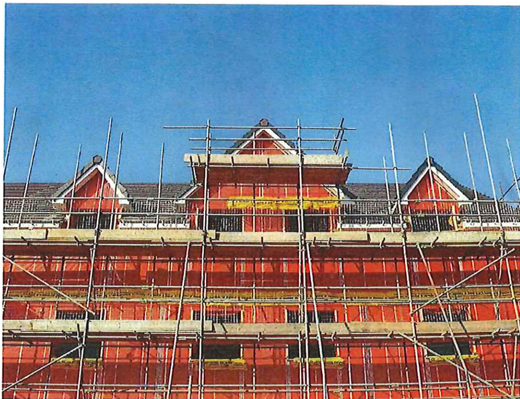
Housing: a new planning self-assessment tool will help councils identify if their local plans meet NPPF rules on new homes

The checklist has been developed in consultation with plan examination body the Planning Inspectorate (PINS) and PAS says it has already tested a draft version with five local