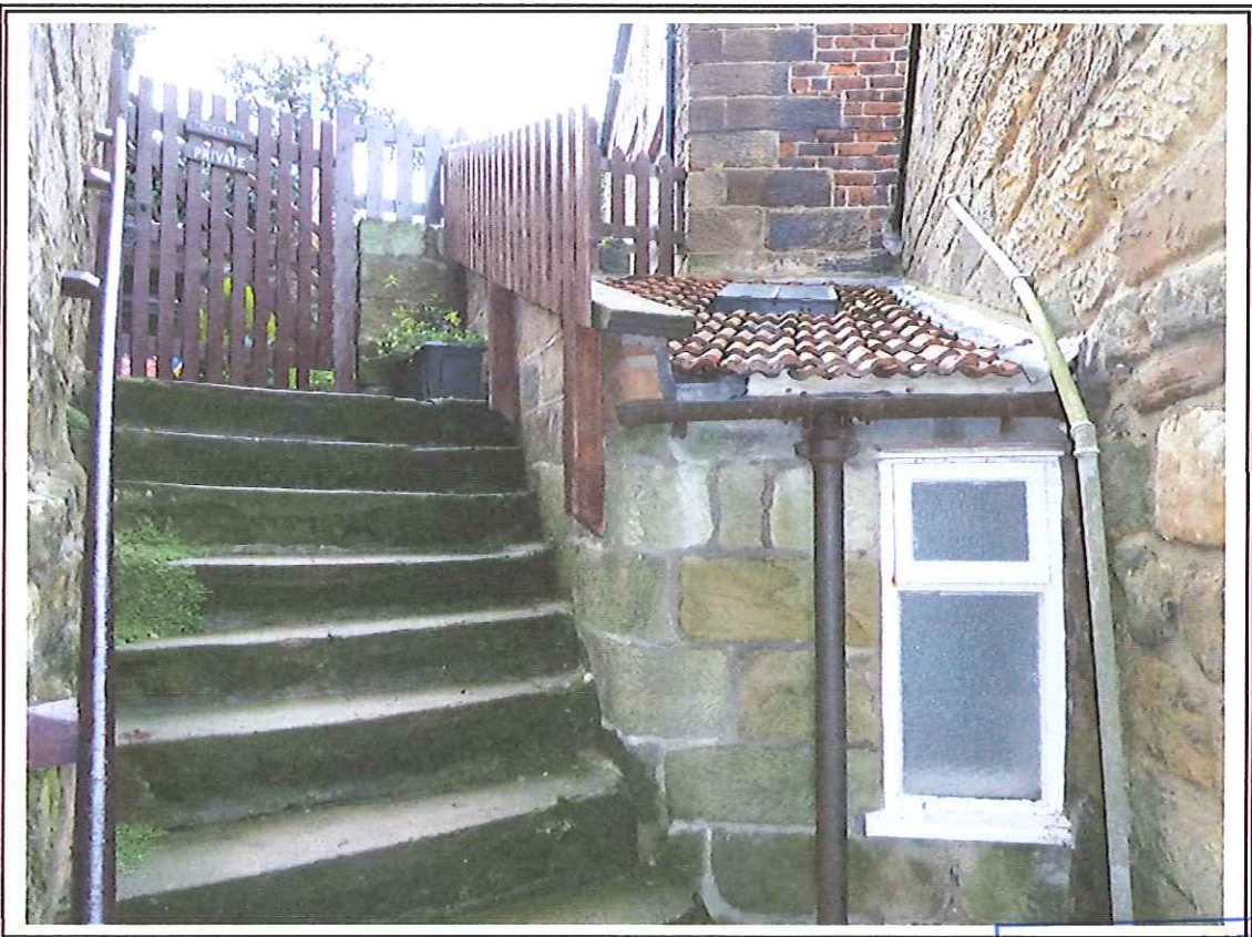
Photo 8 Roof after completion of works.