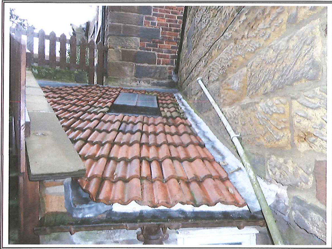
Photo 5 Roof after completion of works. Note same roof pitch and re-used tiles.