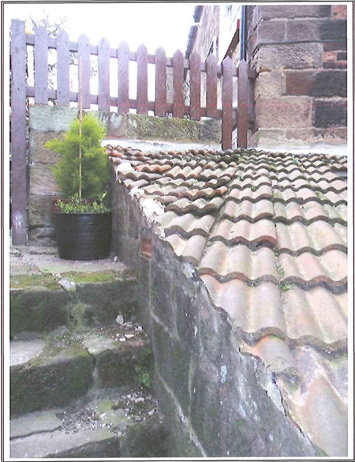
Photo 3 Roof slope to extension in June 2013 prior to works. Note damaged tiles.