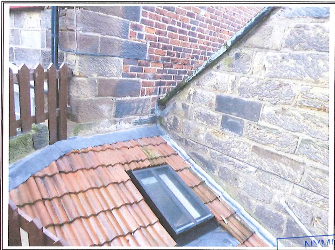
Photo 6 Roof after completion of works. Note conservation rooflight in position of glass tiles.