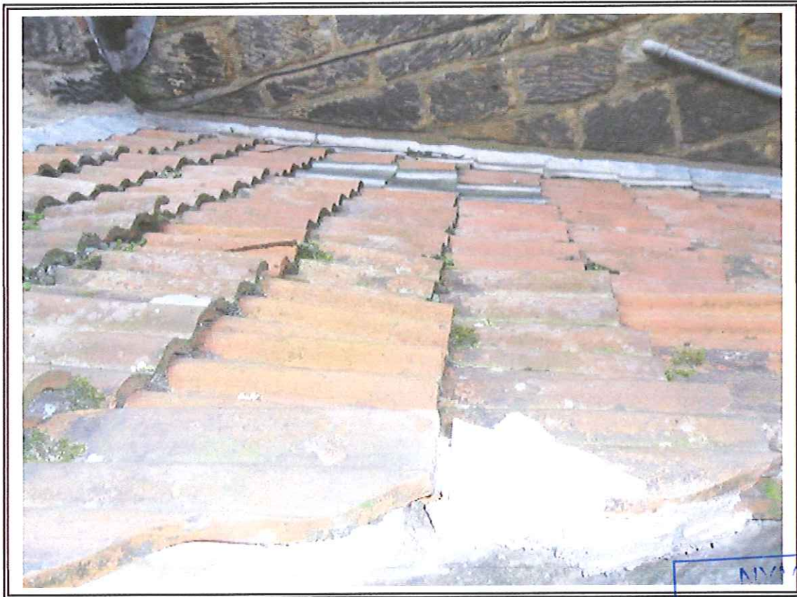
Photo 2 Roof slope to extension in June 2013 prior to works. Note damaged tiles.