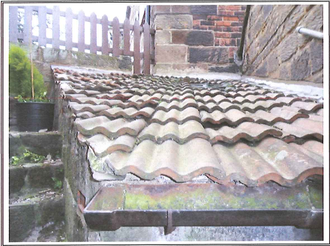
Photo 1 Roof slope to extension in June 2013 prior to works. Note damaged tiles.