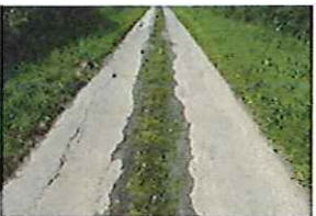
Station Lane Condition (14)