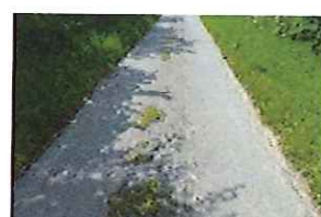
Station Lane Condition (120)