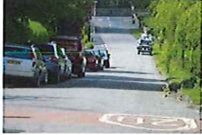
Station Lane Condition (342)