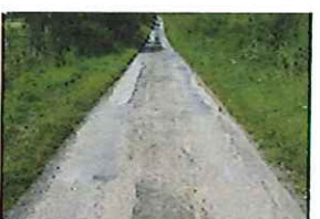
Station Lane Condition (52)