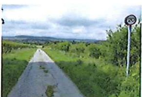
Station Lane Condition (180)