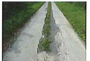
Station Lane Condition (12)