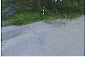
Station Lane Condition (341)