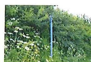
Station Lane Condition (131)