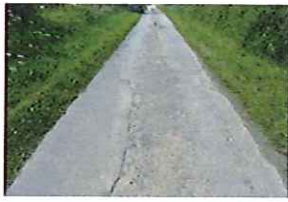
Station Lane Condition (29)