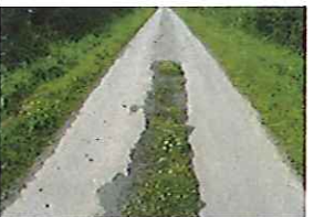
Station Lane Condition (23)