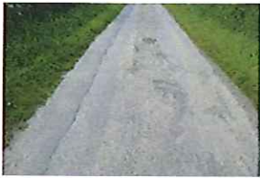
Station Lane Condition (35)