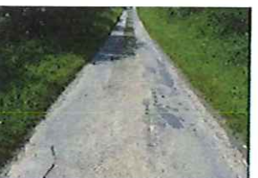
Station Lane Condition (54)