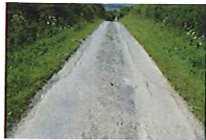
Station Lane Condition (104)