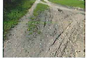
Station Lane Condition (2)