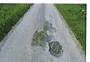
Station Lane Condition (199)