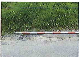
Station Lane Condition (178)