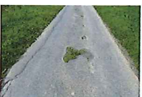
Station Lane Condition (185)