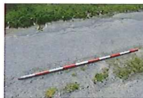
Station Lane Condition (171)