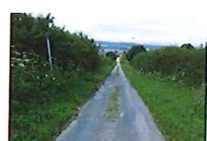
Station Lane Condition (132)