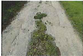
Station Lane Condition (6)