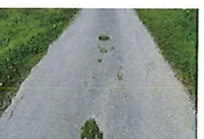
Station Lane Condition (195)