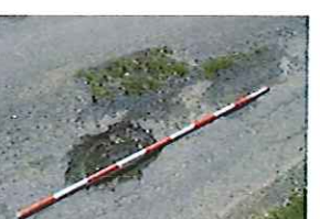
Station Lane Condition (201)