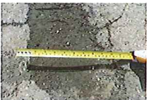
Station Lane Condition (21)