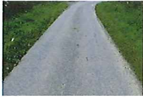
Station Lane Condition (204)