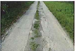
Station Lane Condition (10)