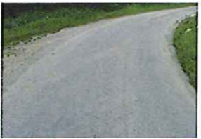
Station Lane Condition (213)