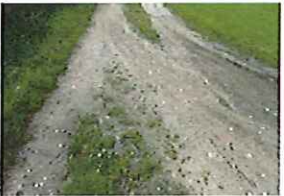
Station Lane Condition (3)