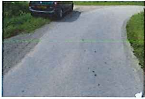
Station Lane Condition (210)