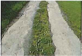
Station Lane Condition (5)