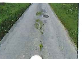
Station Lane Condition (198)