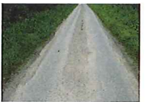
Station Lane Condition (222)