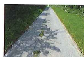
Station Lane Condition (121)