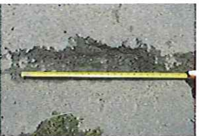
Station Lane Condition (24)