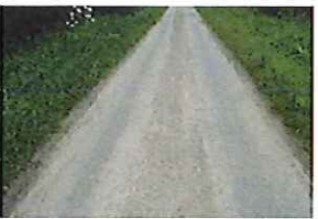
Station Lane Condition (225)