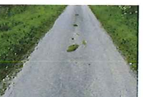
Station Lane Condition (194)