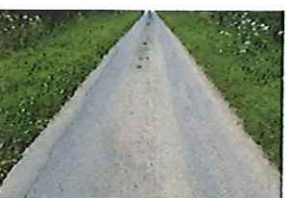
Station Lane Condition (189)