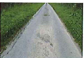
Station Lane Condition (184)