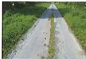
Station Lane Condition (176)