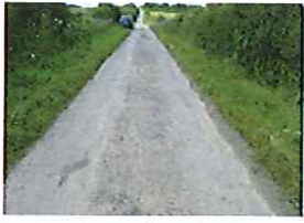
Station Lane Condition (28)