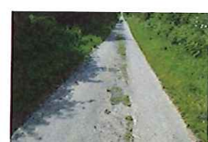
Station Lane Condition (117)