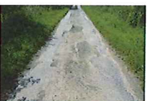
Station Lane Condition (51)