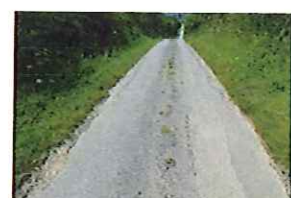
Station Lane Condition (107)