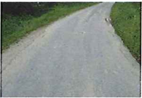
Station Lane Condition (214)