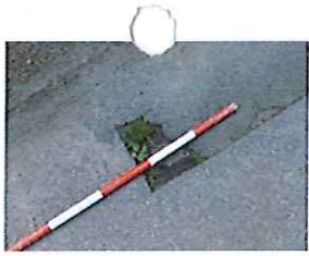
Station Lane Condition (335)