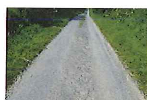
Station Lane Condition (111)