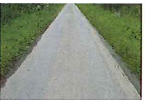
Station Lane Condition (235)