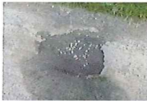
Station Lane Condition (36)