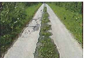
Station Lane Condition (18)