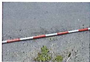
Station Lane Condition (170)