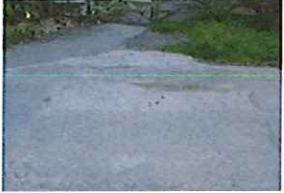
Station Lane Condition (340)