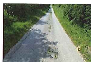
Station Lane Condition (115)