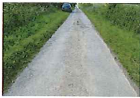
Station Lane Condition (30)