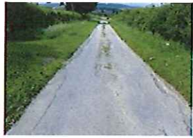
Station Lane Condition (168)