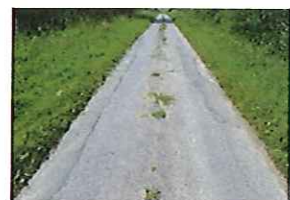
Station Lane Condition (172)