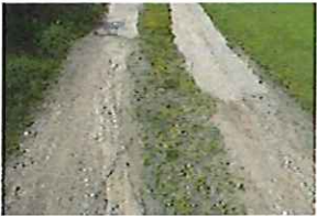
Station Lane Condition (4)