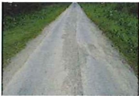
Station Lane Condition (216)