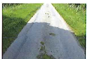
Station Lane Condition (182)