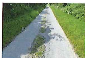
Station Lane Condition (119)