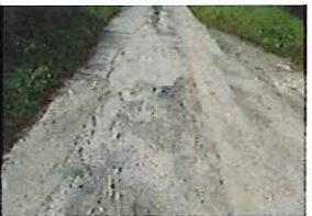
Station Lane Condition (8)