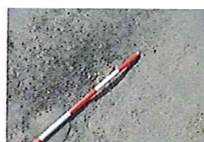
Station Lane Condition (101)