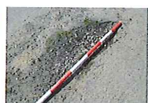
Station Lane Condition (102)