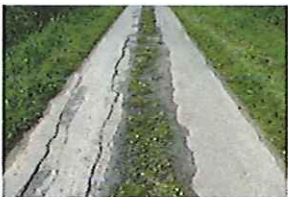
Station Lane Condition (16)