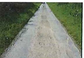
Station Lane Condition (49)