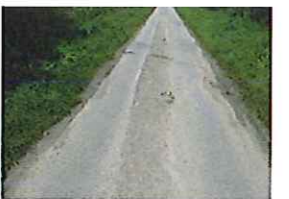
Station Lane Condition (227)