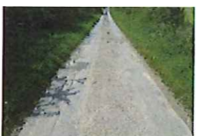
Station Lane Condition (47)