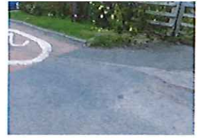
Station Lane Condition (339)