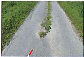
Station Lane Condition (175)