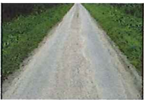
Station Lane Condition (221)