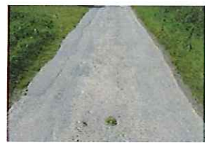
Station Lane Condition (32)