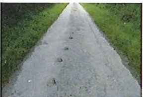
Station Lane Condition (26)