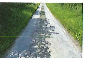
Station Lane Condition (55)