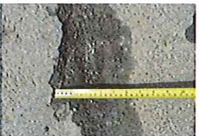
Station Lane Condition (25)