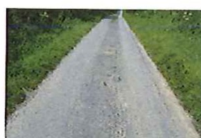
Station Lane Condition (110)