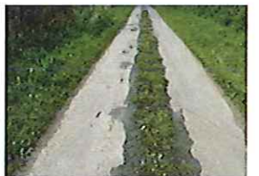
Station Lane Condition (17)