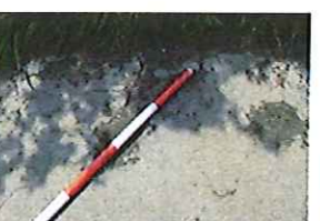
Station Lane Condition (61)