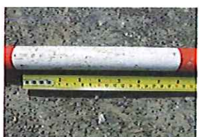
Station Lane Condition (42)