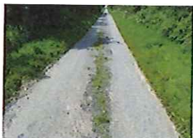
Station Lane Condition (118)