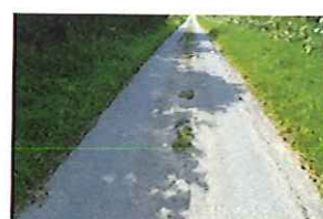
Station Lane Condition (125)