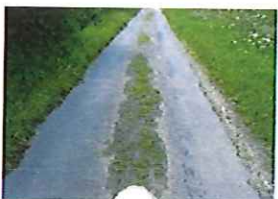
Station Lane Condition (128)