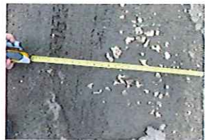
Station Lane Condition (37)