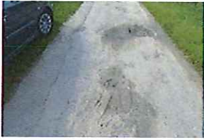
Station Lane Condition (34)