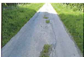
Station Lane Condition (181)