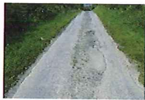
Station Lane Condition (99)