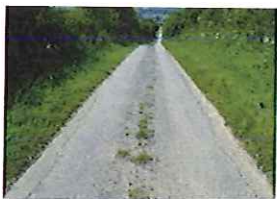
Station Lane Condition (108)