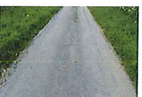
Station Lane Condition (196)