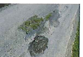
Station Lane Condition (200)