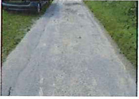
Station Lane Condition (33)