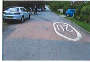
Station Lane Condition (338)