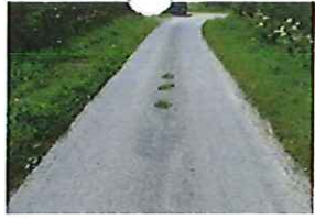
Station Lane Condition (203)