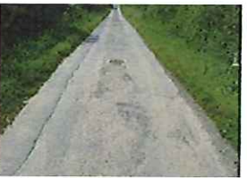
Station Lane Condition (43)