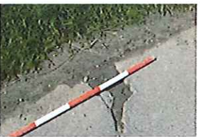
Station Lane Condition (229)