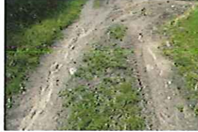
Station Lane Condition (1)