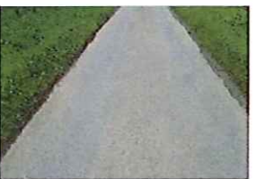
Station Lane Condition (233)