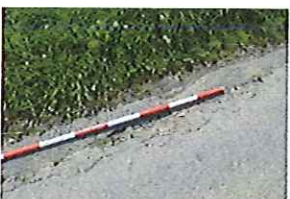
Station Lane Condition (179)