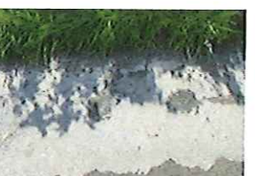
Station Lane Condition (60)