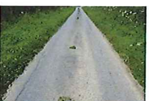
Station Lane Condition (190)