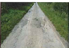
Station Lane Condition (46)