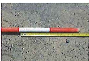
Station Lane Condition (41)