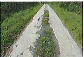
Station Lane Condition (19)