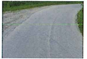
Station Lane Condition (212)