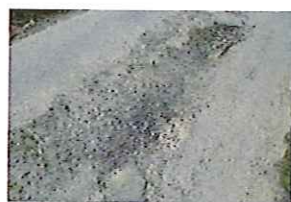
Station Lane Condition (100)