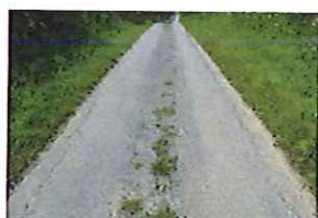
Station Lane Condition (109)