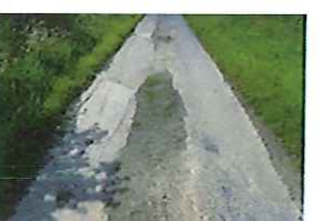
Station Lane Condition (62)