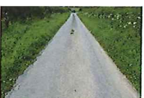
Station Lane Condition (191)