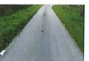
Station Lane Condition (202)