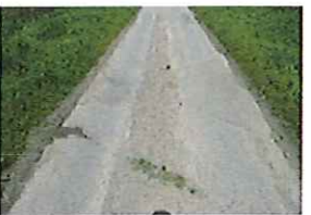
Station Lane Condition (228)