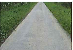
Station Lane Condition (236)