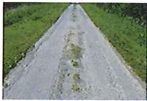
Station Lane Condition (169)