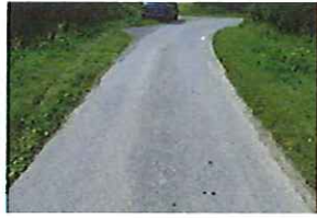
Station Lane Condition (205)