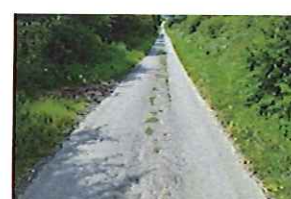
Station Lane Condition (116)