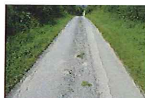
Station Lane Condition (106)