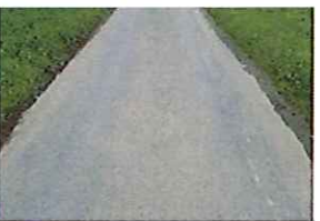
Station Lane Condition (234)