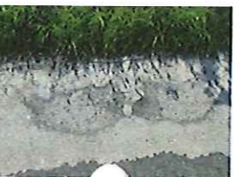
Station Lane Condition (58)