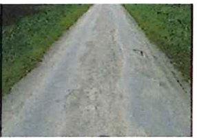
Station Lane Condition (218)