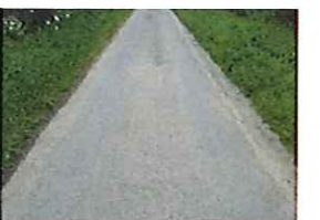
Station Lane Condition (237)