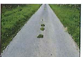
Station Lane Condition (192)