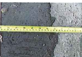
Station Lane Condition (40)