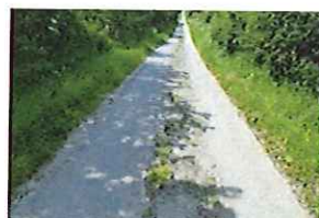
Station Lane Condition (114)