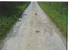
Station Lane Condition (48)