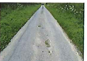
Station Lane Condition (188)