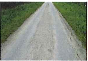
Station Lane Condition (220)