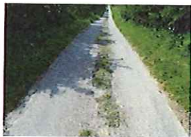
Station Lane Condition (113)