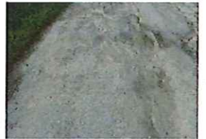
Station Lane Condition (7)