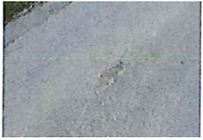
Station Lane Condition (208)