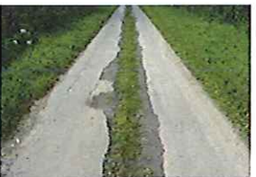
Station Lane Condition (13)