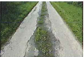
Station Lane Condition (15)