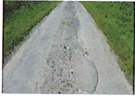
Station Lane Condition (103)