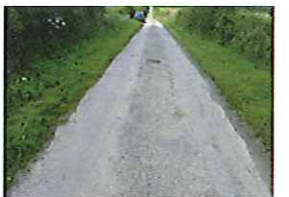
Station Lane Condition (27)