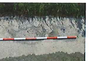
Station Lane Condition (59)