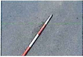
Station Lane Condition (209)