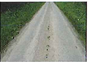
Station Lane Condition (223)