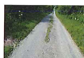
Station Lane Condition (112)