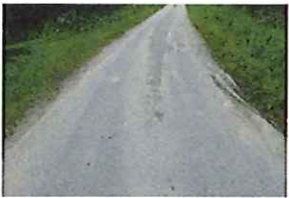
Station Lane Condition (215)