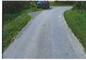
Station Lane Condition (206)