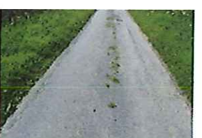
Station Lane Condition (197)