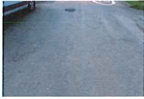
Station Lane Condition (336)