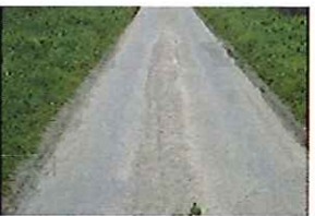
Station Lane Condition (230)