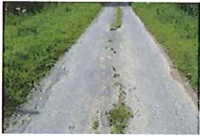
Station Lane Condition (174)