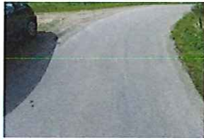
Station Lane Condition (211)