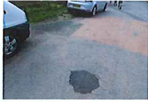
Station Lane Condition (337)