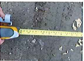
Station Lane Condition (38)