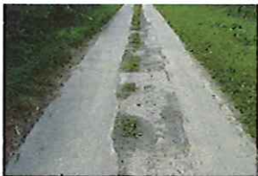
Station Lane Condition (11)