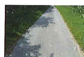
Station Lane Condition (122)