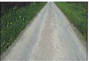
Station Lane Condition (224)