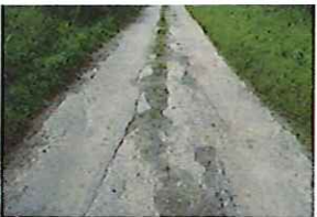
Station Lane Condition (9)