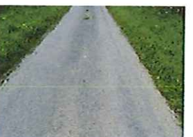
Station Lane Condition (193)