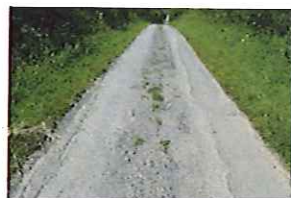
Station Lane Condition (105)