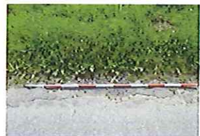
Station Lane Condition (177)