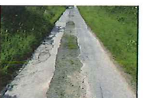
Station Lane Condition (57)