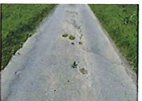
Station Lane Condition (183)