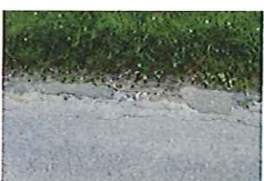
Station Lane Condition (186)