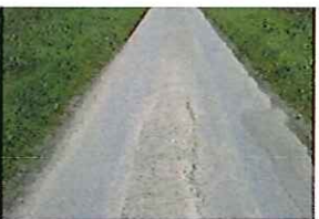
Station Lane Condition (231)