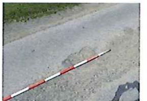
Station Lane Condition (217)