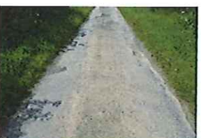
Station Lane Condition (50)