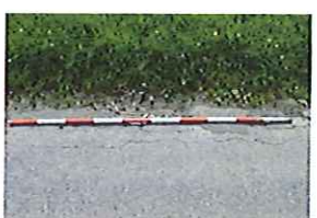
Station Lane Condition (187)