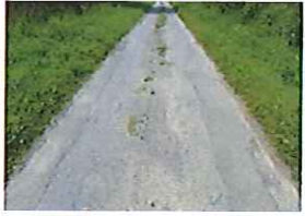
Station Lane Condition (173)