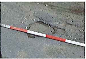
Station Lane Condition (219)