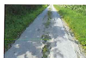
Station Lane Condition (126)