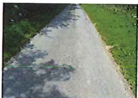
Station Lane Condition (123)