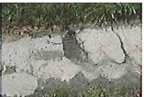
Station Lane Condition (20)