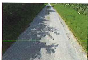
Station Lane Condition (124)