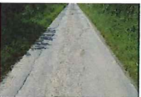
Station Lane Condition (44)