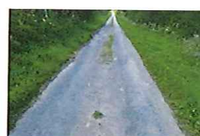
Station Lane Condition (130)