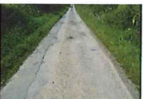
Station Lane Condition (45)