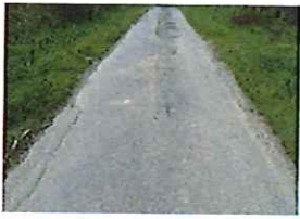
Station Lane Condition (98)