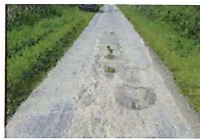
Station Lane Condition (31)