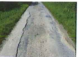
Station Lane Condition (53)