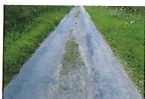
Station Lane Condition (129)