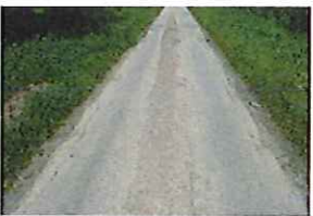
Station Lane Condition (226)