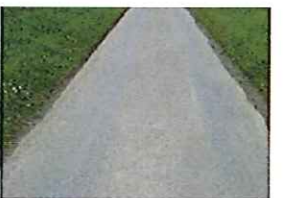
Station Lane Condition (232)