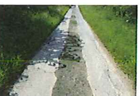
Station Lane Condition (56)