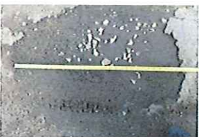
Station Lane Condition (39)