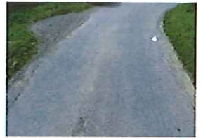
Station Lane Condition (207)