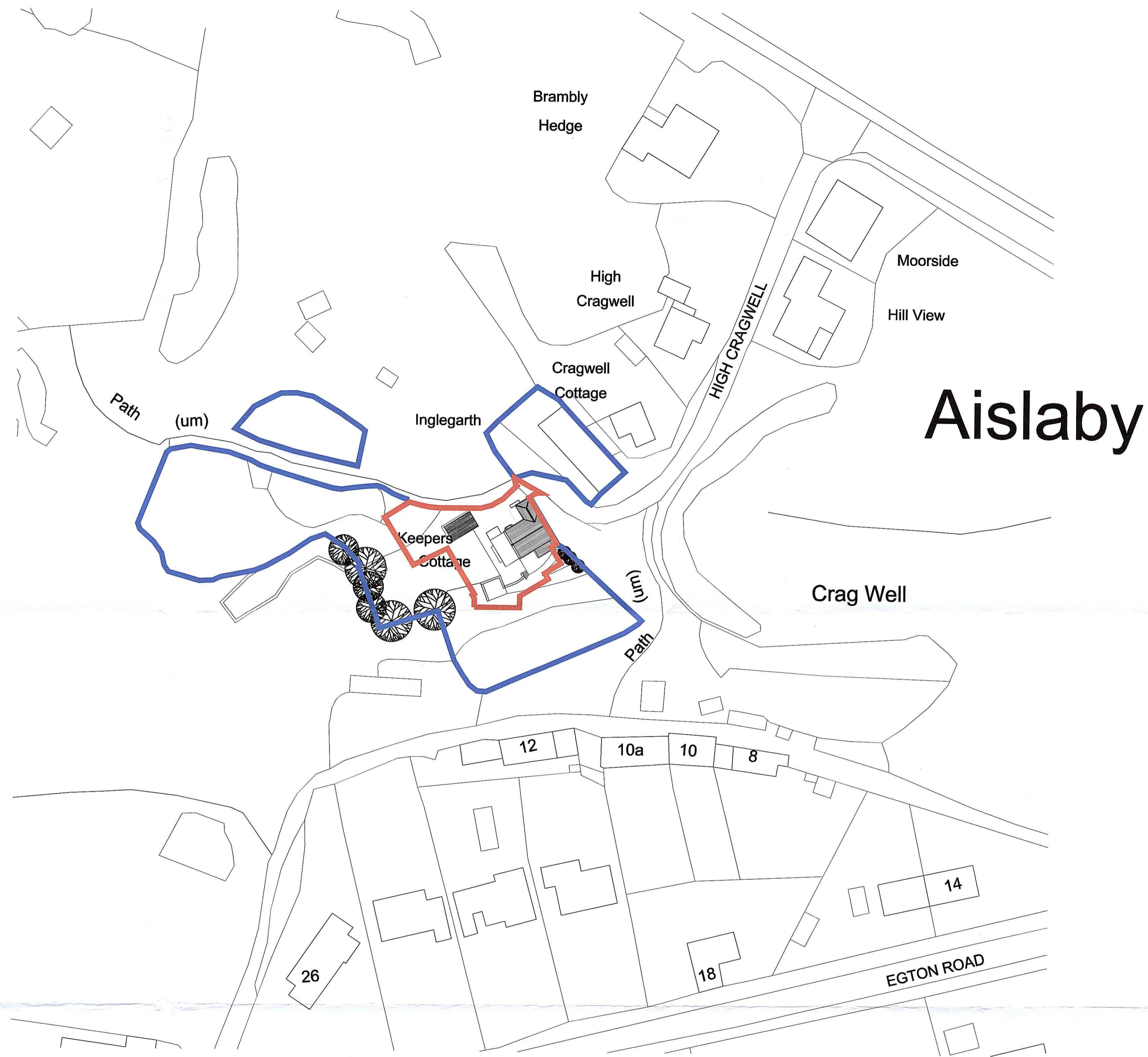
1:500 SITE LOCATION