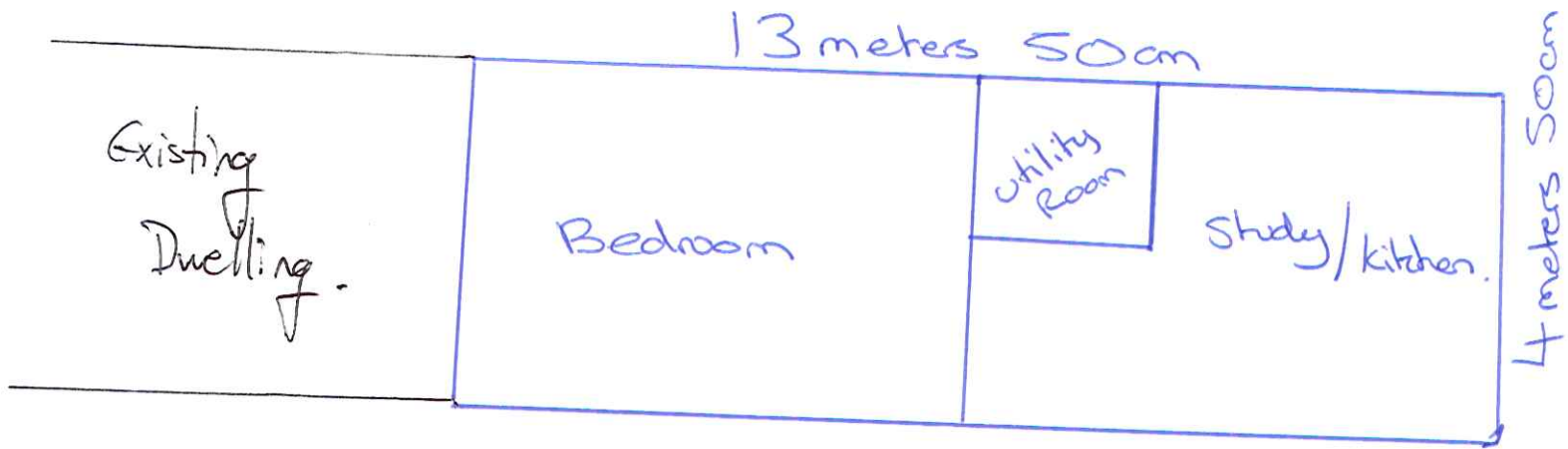
Internal floor Plan.