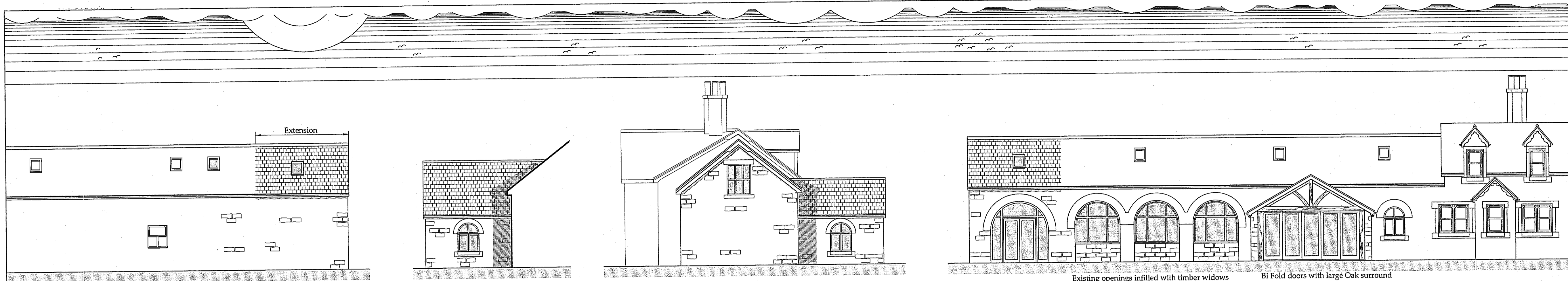
Rear Elevation (N) SCALE: 1:100