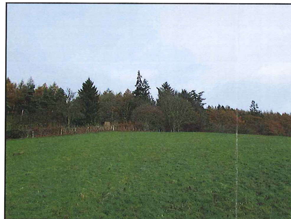
EXISTING SITE PHOTO