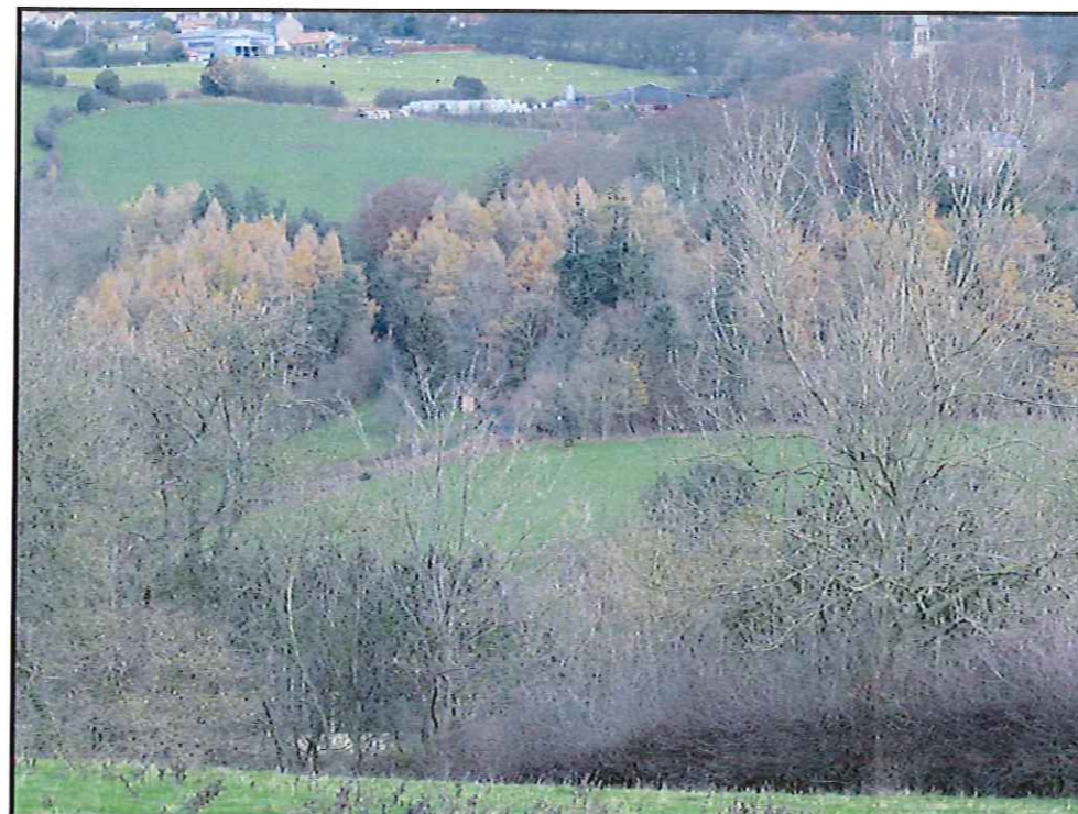
PROPOSED SITE PHOTO