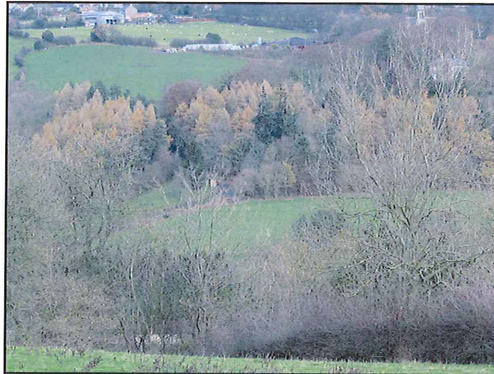
EXISTING SITE PHOTO