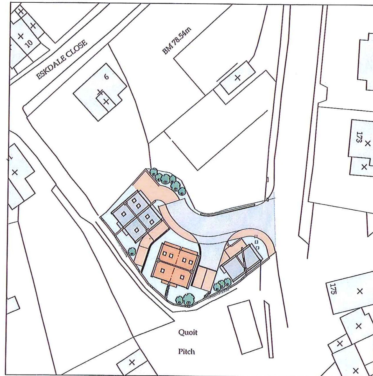
○ Site Block Plan SCALE: 1:500

b h d partnership Airy Hill Manor, Whitby, North Yorkshire, UK, YO21 1QB. www.bhdpartnership.com