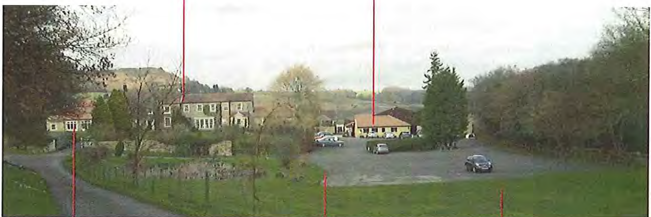
extension to hotel completed last year