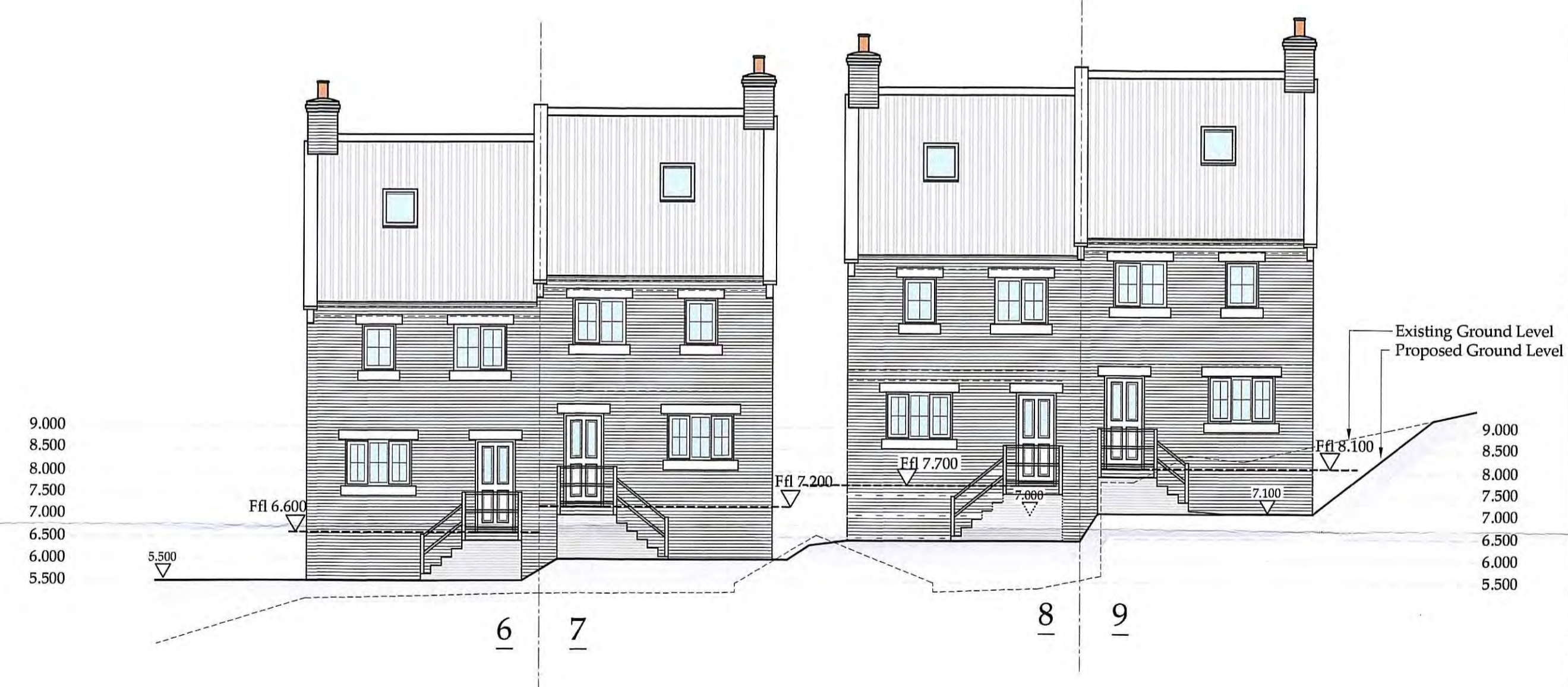
View from West