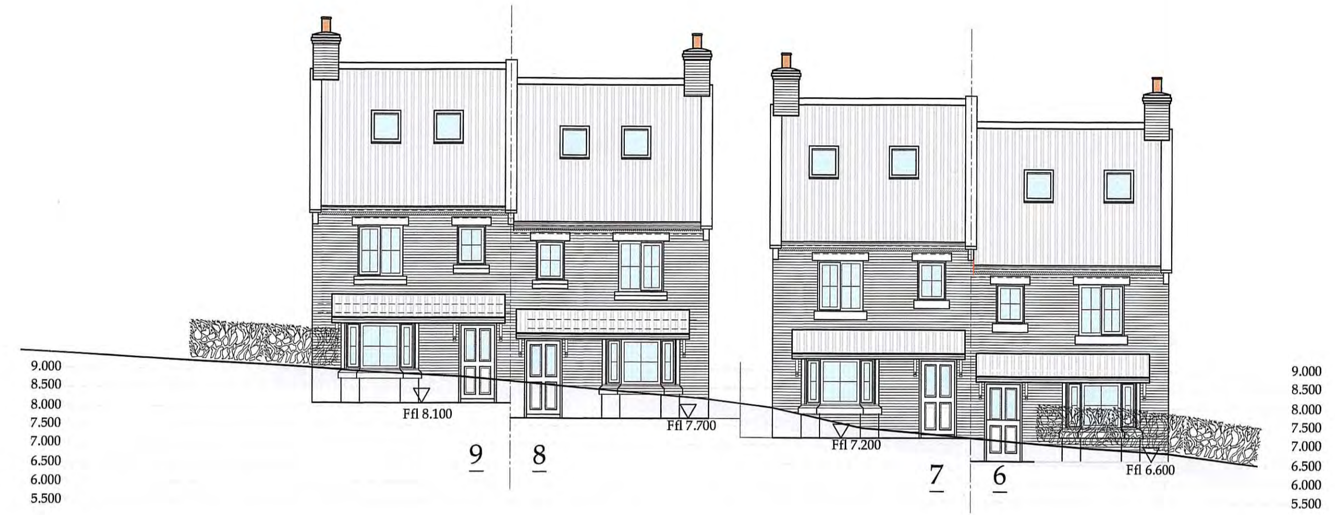
View from Coach Road (east)