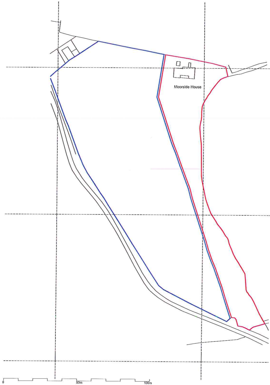
Site Location Plan Scale 1:1250 @ A3