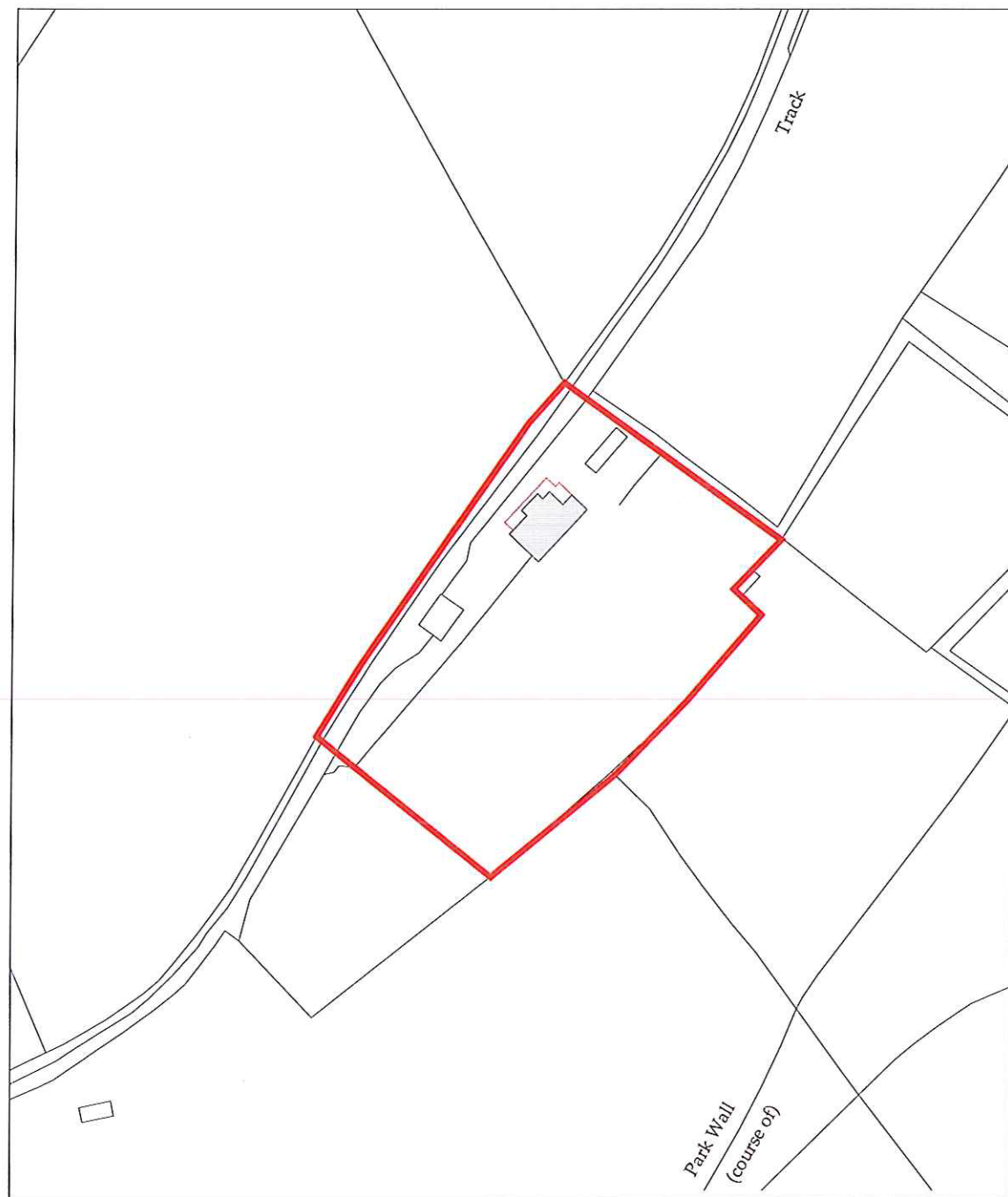
○ Site Plan Scale 1:2500