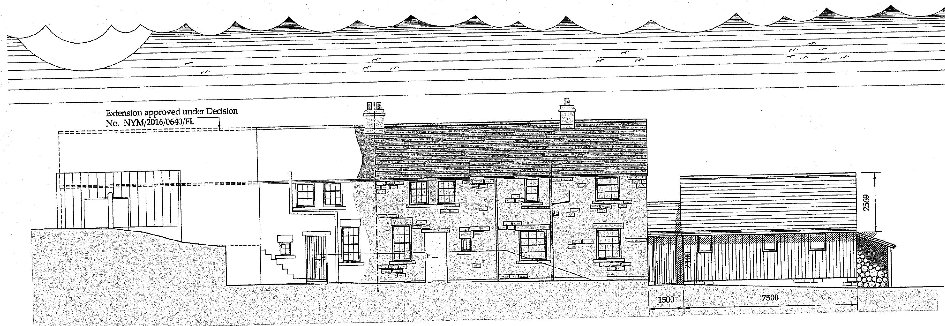
Front Elevation - East Scale 1:100