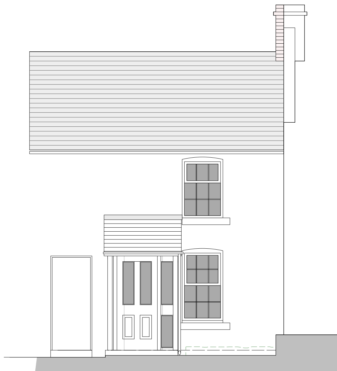
N O R T H E A S T